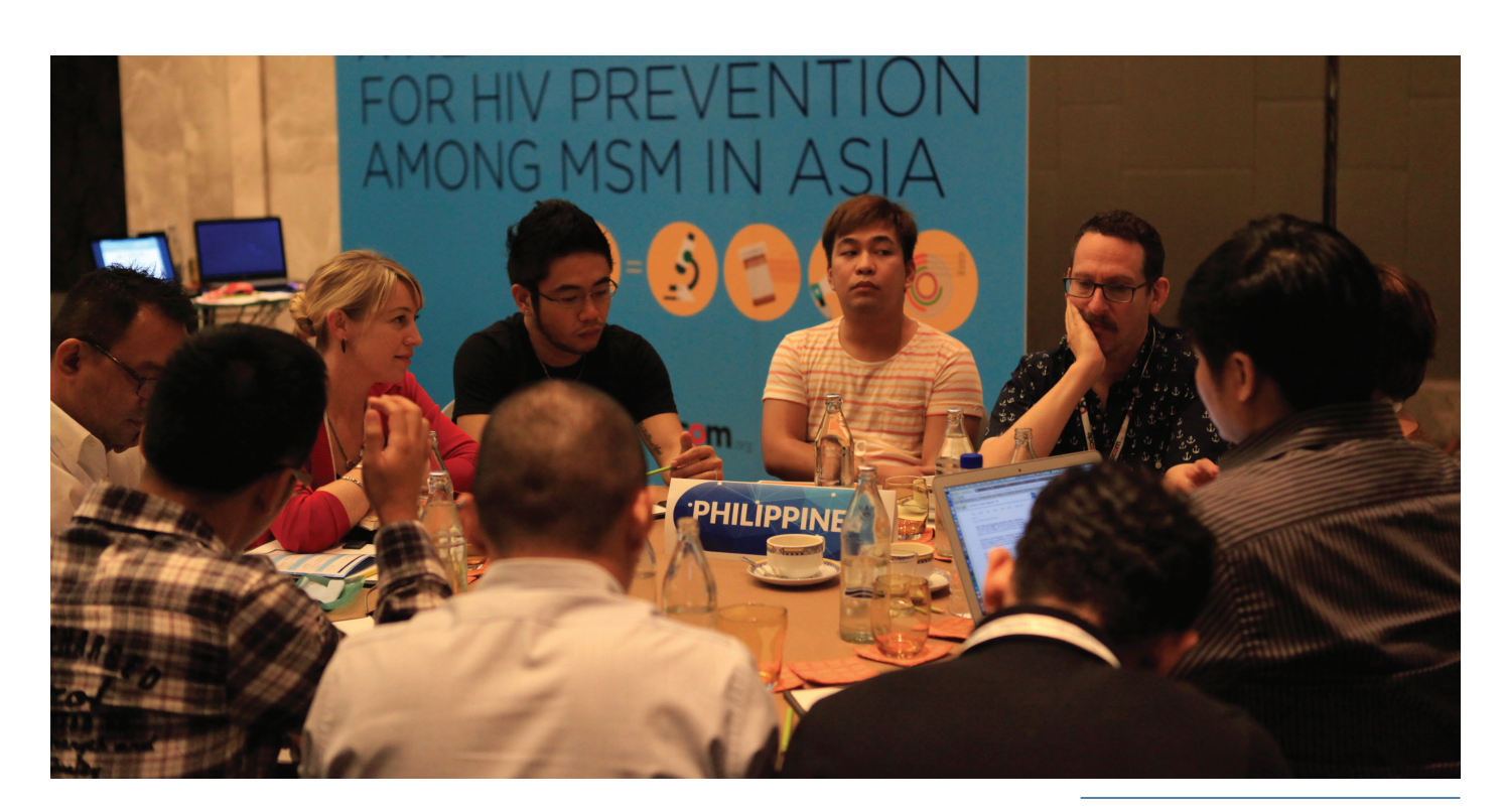
Philippines's working group at PrEParing Asia Consultation 2015 Bangkok, Thailand

At least half of the 12 responding countries have reported significant progress toward establishing pilot projects that can begin delivering PrEP to key affected populations in a number of major cities. This momentum will help to encourage similar projects in other countries, while also strengthening the evidence base for scaling up PrEP delivery and services.