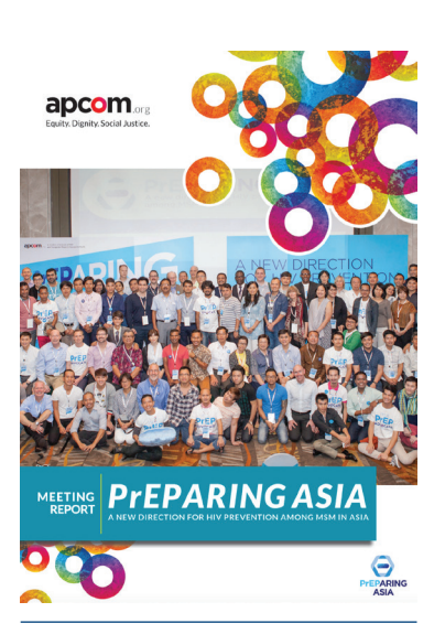
Cilck the image above to download the report of PrEParing Asia

The consultation quickly stimulated interest in PrEP in numerous countries. Within weeks of the consultation, FHI 360 received requests from several countries asking how they could start PrEP.