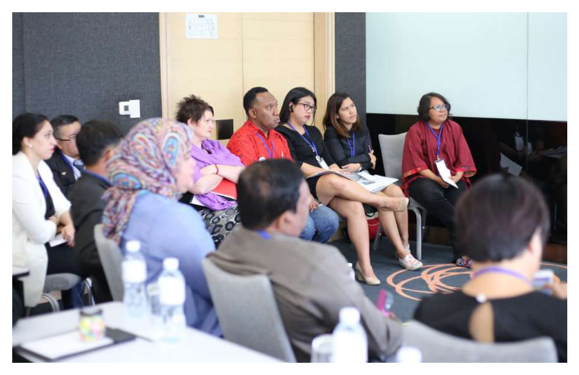
↑ Delegates join a panel on increasing access to healthcare.