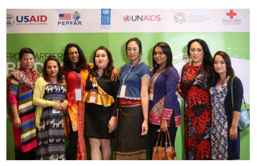
↑ Participants at the FB2B conference.

Pathologisation not only creates stigma and discrimination, including in healthcare settings [8,33,34], but has also been used as a rationale for requiring trans people to undergo gender affirming surgeries or sterilisation as a prerequisite for legal gender recognition. Such provisions have been challenged and overturned by the European Court of Human Rights [35] and several Constitutional Courts [36,37] and are increasingly condemned by human rights bodies. [38]