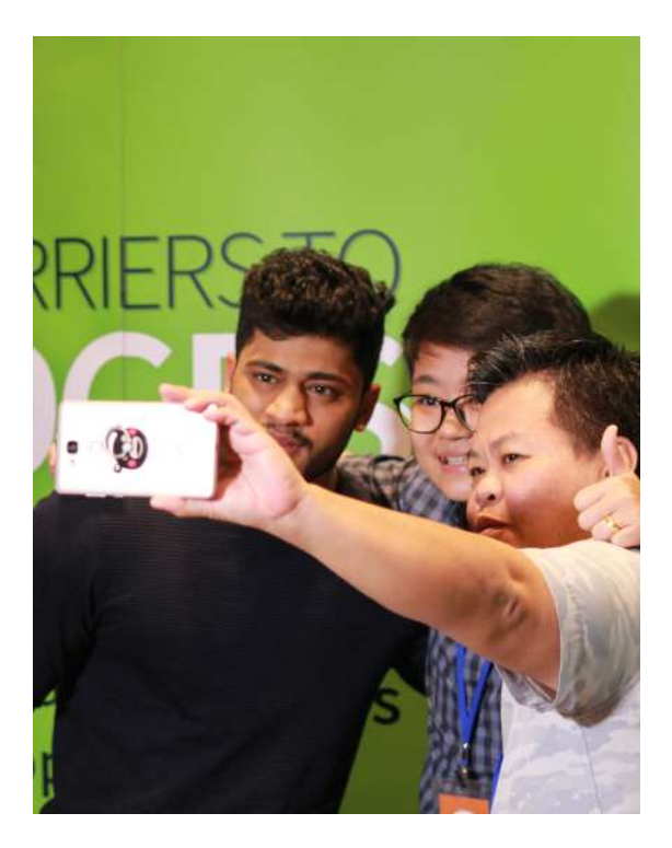
↑ Participants at the FB2B conference.

Trans people in Asia face high rates of stigma, discrimination, and gender-based violence both within private spaces, including from family members and intimate partners, and in areas of public life. The Commission on Human Rights of the Philippines has acknowledged the need to address the level of murders and hate crimes against transgender people, especially transgender women, in a signed Memorandum of Understanding with the community. The global Trans Murder