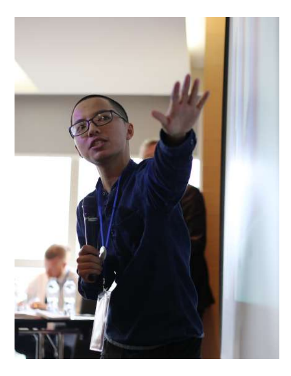
▲ Vietnamese delegate speaks about his involvement with legal gender recognition and the government.

Trans and other international human rights experts continue to advocate for the specific removal of diagnostic classifications that pathologise gender diversity in children and young people. [20, 24, 27]