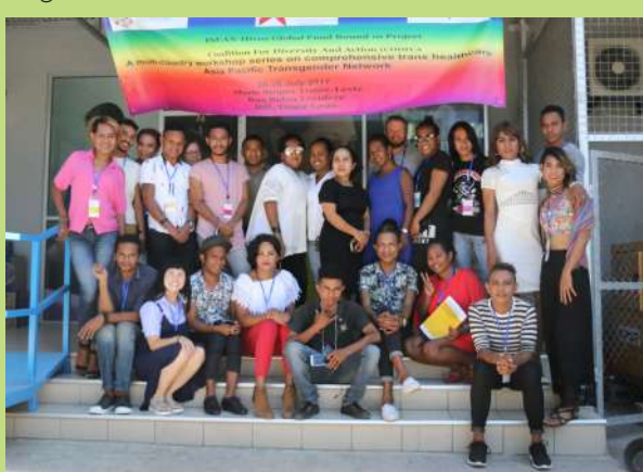
↑ Expanding the Circle: A multi-country workshop series on comprehensive trans healthcare. The Singapore participants map out their ideal and comprehensive healthcare.

In addition, APTN hosted a three-day knowledge exchange to Bangkok for representatives from the Vietnamese Ministries of Justice and Health and iSee, a community-based organisation based in Ha Noi. The study tour involved conversations with members of the trans community, Thai government ministries, and health professionals providing gender affirming health services and other care to trans people. It was a timely exchange as Viet Nam's Ministry of Health is mandated with implementing the legalisation of access to gender affirming health services and legal gender recognition in Viet Nam.