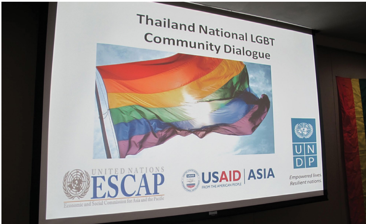
Screenshot of the sign for the Thailand national LGBT community dialogue