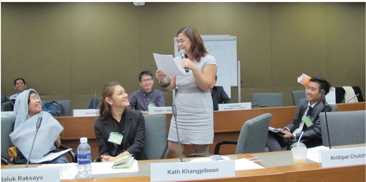
Findings and recommendations of the dialogue being presented by participants

The following section provides an overview of the protection of the rights of LGBT people in six areas: employment and housing; education and young people; health and well-being; family affairs and social and cultural attitudes; media and information and communication technology; and the organizational capacity of LGBT organizations.