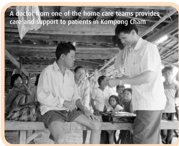
A doctor from one of the home care teams provides care and support to patients in Kompong Cham

KHANA supports 32 home care teams in 6 provinces - Phnom Penh, Battambang, Kompong Cham, Siem Reap, Takeo, and Sihanoukville. Home care teams provide community-based care for people with HIV and other chronic illnesses. All home care teams are based in local health centres. The teams are made up of government health care staff, NGO staff and community volunteers, including people living with HIV/AIDS. Each home care team also provides support to group(s) of people with HIV at community level, which link closely with CPN+. Home care teams provide basic clinical care, psychosocial support and support for referral and follow-up.