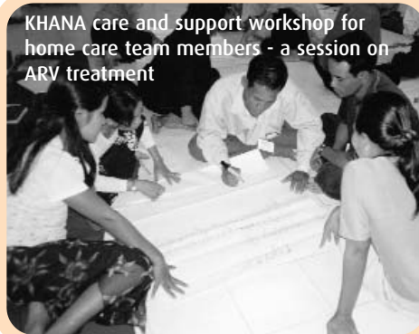
KHANA care and support workshop for home care team members - a session on ARV treatment

Very little information exists on the health status of those receiving home care. Some groups reported higher numbers of sick patients (Stage 3 and 4 AIDS) than others. Overall, it was thought that 75% of those benefiting from home care were 'sick'. Few records exist of hospital admissions and referrals, or markers of disease progression such as OIs, weight loss, or CD4 counts. While some of these details could be obtained for some home care teams, generally there is very little sharing of information between hospitals and home care teams. Care provision in home care is very variable. Some of the groups have close supervision by doctors, and provide higher level of OI care and treatment than others. The home care guidelines provide for basic palliative care, and until recently did not include cotrimoxazole prophylaxis. The use of cotrimoxazole has been standard in some home care groups for over 2 years (as has use of fluconazole and acyclovir), while others have awaited official government support.