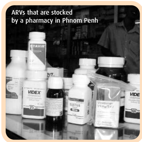
ARVs that are stocked by a pharmacy in Phnom Penh

The overall effect is the impoverishment of already poor households, paying high prices for inappropriate and ineffective drugs. It is estimated that 46% of land sold by households is sold to fund costs of health care, including the cost of transportation to health services. Effective care for people with HIV is particularly lacking, with many of the problems mentioned above being particularly acute for people with HIV. Stigma and discrimination associated with HIV/AIDS further reduces access to resources, such as information and services, and results in decreasing access to care and support. This also leads to people accessing health care inappropriately, which can be dangerous and lead to further poverty. Amongst those who are aware of treatment and care, poverty and cost is seen as the greatest barrier, and poor experience of hospital care often prevents patients from attending public services for treatment. Private sector, and traditional medicine, as with other illnesses, accounts for the majority of treatment-seeking episodes. Many also concurrently seek treatment from western or allopathic medicine and traditional medicine. Mistrust of the public sector is often deeply entrenched in people's minds, leading to scepticism of care and treatment offered through these services. While the availability of ARVs alone may go some way to dispelling this, without other measures the mistrust may prejudice the overall success of the treatment.