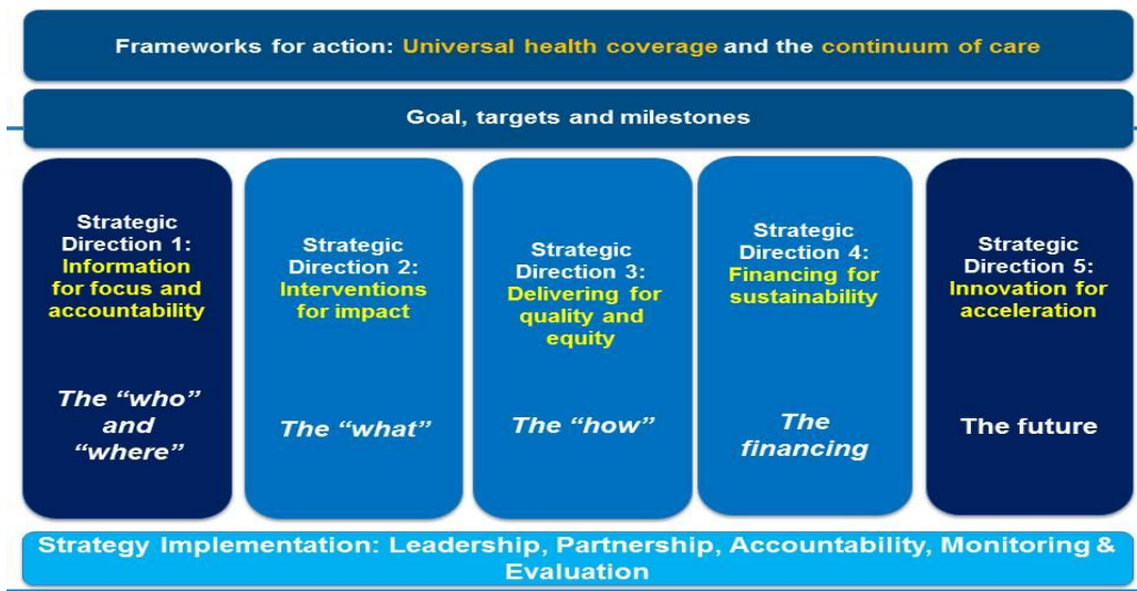
Figure 2: Structure of the three Global Health Sector Strategies covering HIV, viral hepatitis and sexually transmitted infections, 2016–2021