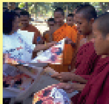
A health worker from Svay Rieng provincial hospital in Cambodia distributes AIDS awareness and prevention materials to young monks.