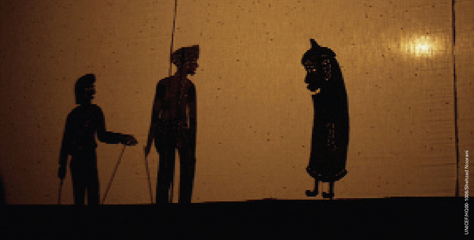
A shadow puppet show designed to educate youth on HIV/AIDS is performed by local artists in Phnom Penh, Cambodia in 2000.

Thailand is less rigorous than it was in the 1990s, and consequently, young people, particularly young women, often possess only a shaky knowledge of HIV/AIDS. 72 Gender discrimination in this region thwarts access to information for girls. Sex is often viewed as an inappropriate subject for discussion. And as mentioned before, girls are more likely to be withdrawn from school – a potentially effective outlet for knowledge about HIV prevention.