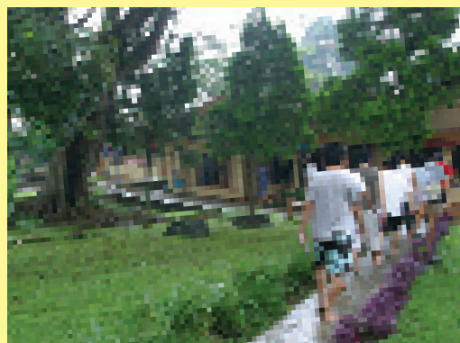
Yayasan Harapan Permata Kita (YAKITA) provides peer education and counselling for young people in East Java.

But there is much more to be done. Similar projects need to be established in other parts of the Indonesian archipelago, including the remote eastern province of Papua, which has a disproportionately high number of the country’s HIV cases.