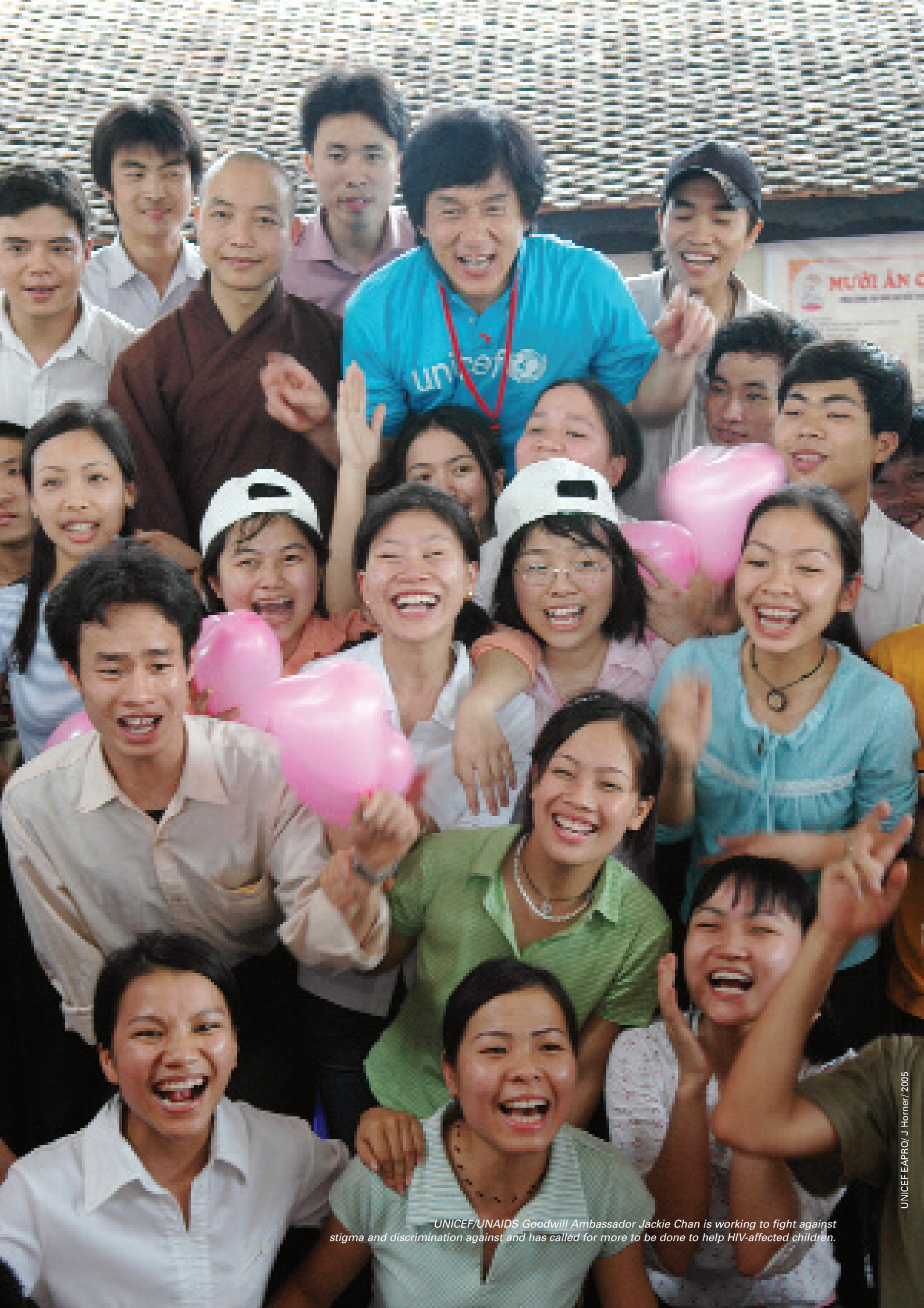
UNICEF/UNAIDS Goodwill Ambassador Jackie Chan is working to fight against stigma and discrimination against and has called for more to be done to help HIV-affected children.