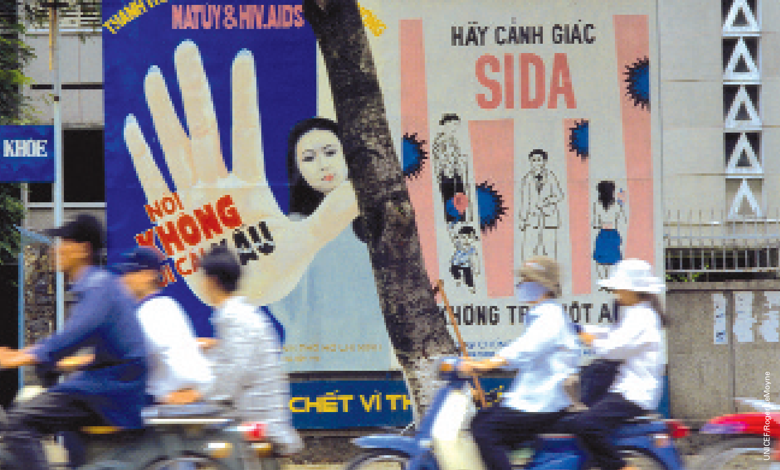
An HIV/AIDS awareness billboard in downtown Ho Chi Minh City, Viet Nam

Above all, this option must place children at the forefront of a comprehensive HIV/AIDS response. It has been proven time and time again throughout East Asia that targeting children and adolescents and allowing them to participate can effect change and reverse trends. Young people grasp the message of prevention quickly given the right support. Surveys show teenage boys in Cambodia are far more likely to use condoms than adult men while male youths in Thailand are less likely to visit sex workers thanks to aggressive prevention initiatives. 7