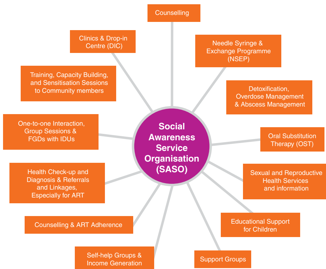
Figure 20: Framework for integrated harm reduction, HIV and SRHR services for women who use drugs, SASO (India)