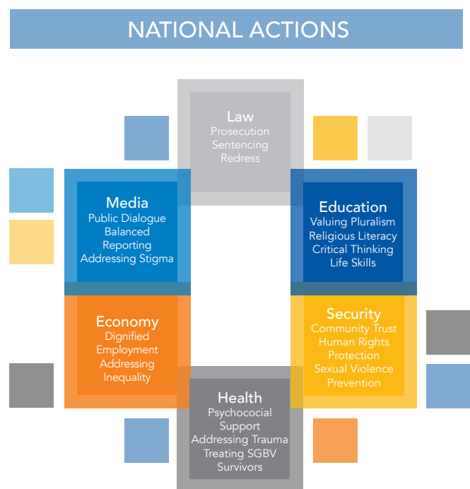
Figure 2: Individuals returning from association with VE groups have multiple and interrelated needs