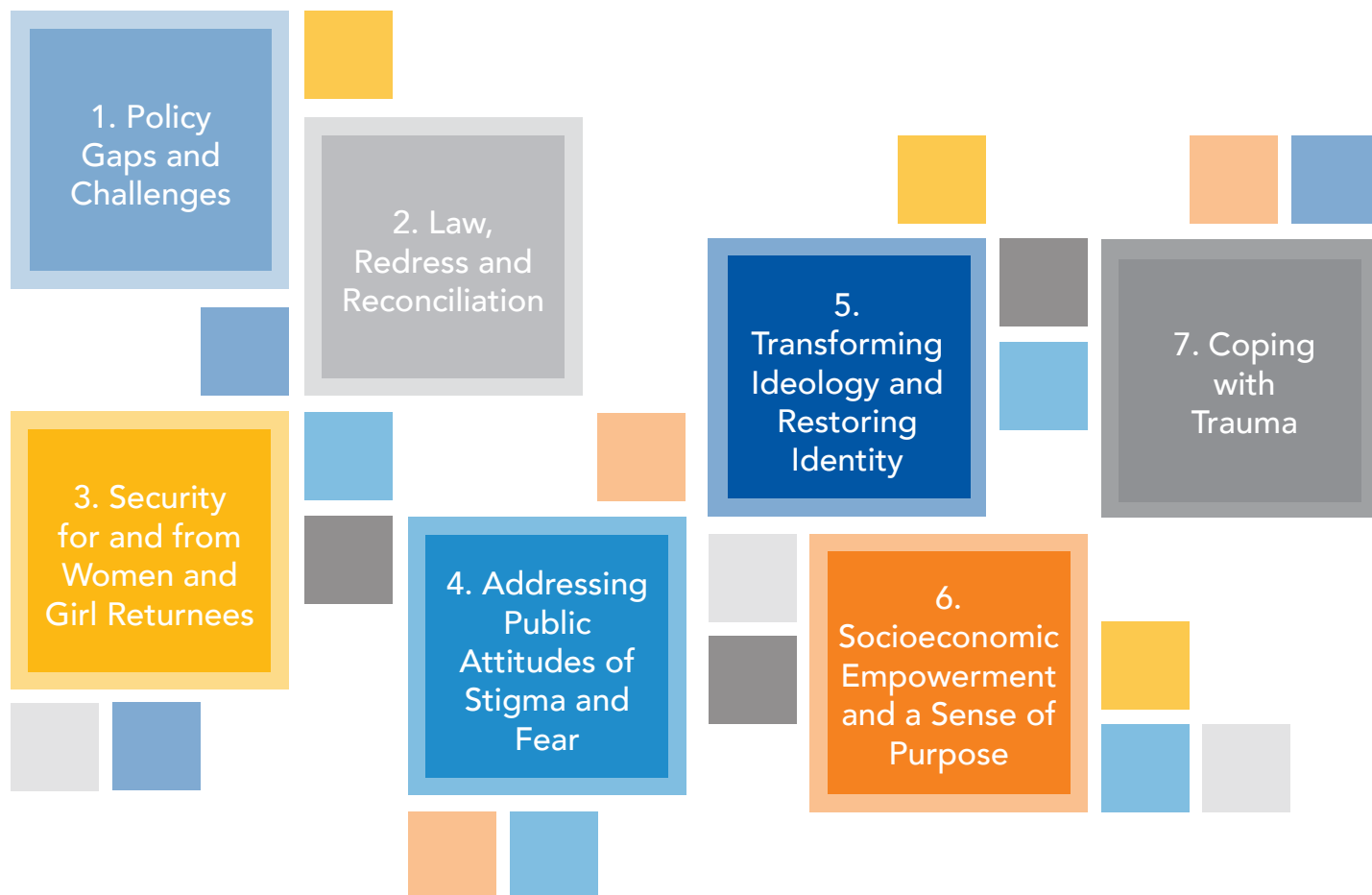
Figure 8: The seven elements of a holistic and gendered approach to disengagement, rehabilitation and reintegration.

This research finds that a holistic multisectoral approach is essential for successful disengagement, rehabilitation and reintegration programmes for women and girls associated with violent extremism. This is demonstrated by the approaches of women peacebuilders who are on the front lines of responding to the gendered dimensions of return. Each of the examples of good practice profiled in Part II of this report address several of the critical themes and areas of intervention identified and elaborated in Part I. Policymakers and practitioners can ensure disengagement, rehabilitation and reintegration programming is holistic by: