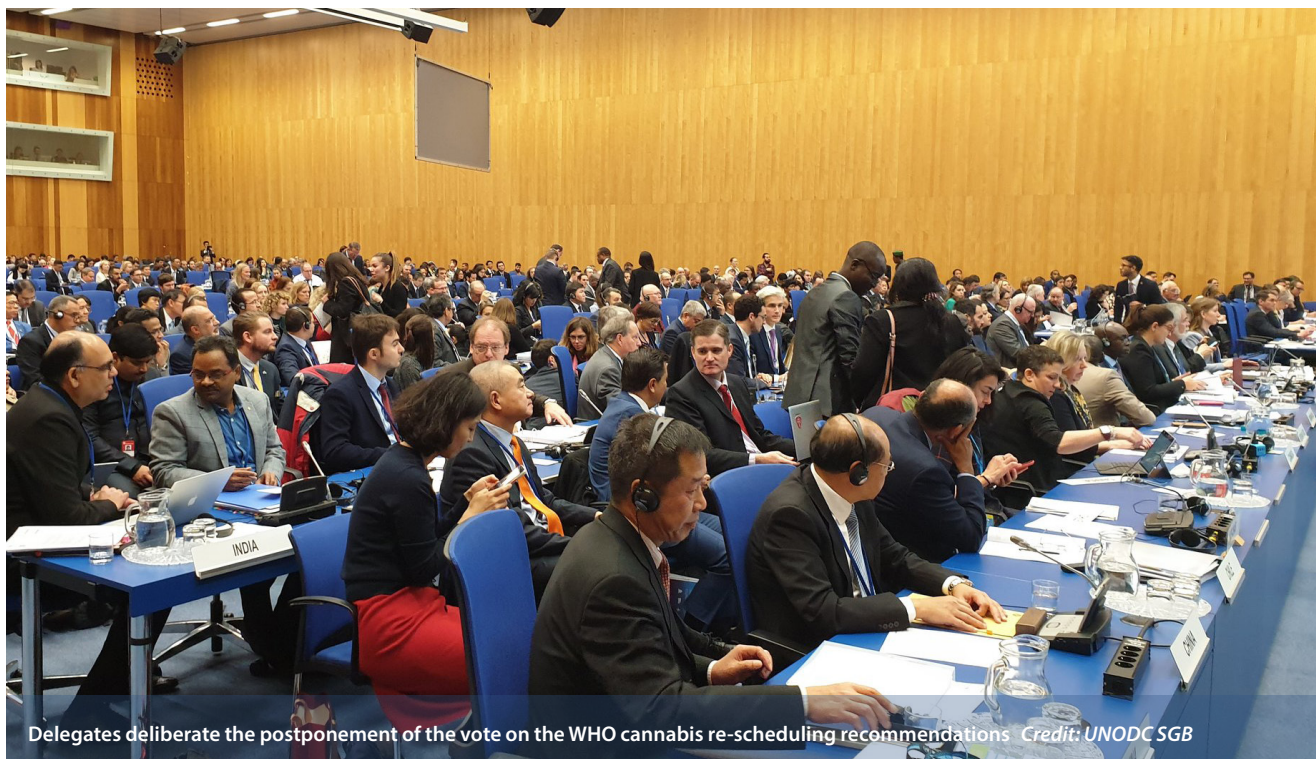
Delegates deliberate the postponement of the vote on the WHO cannabis re-scheduling recommendations