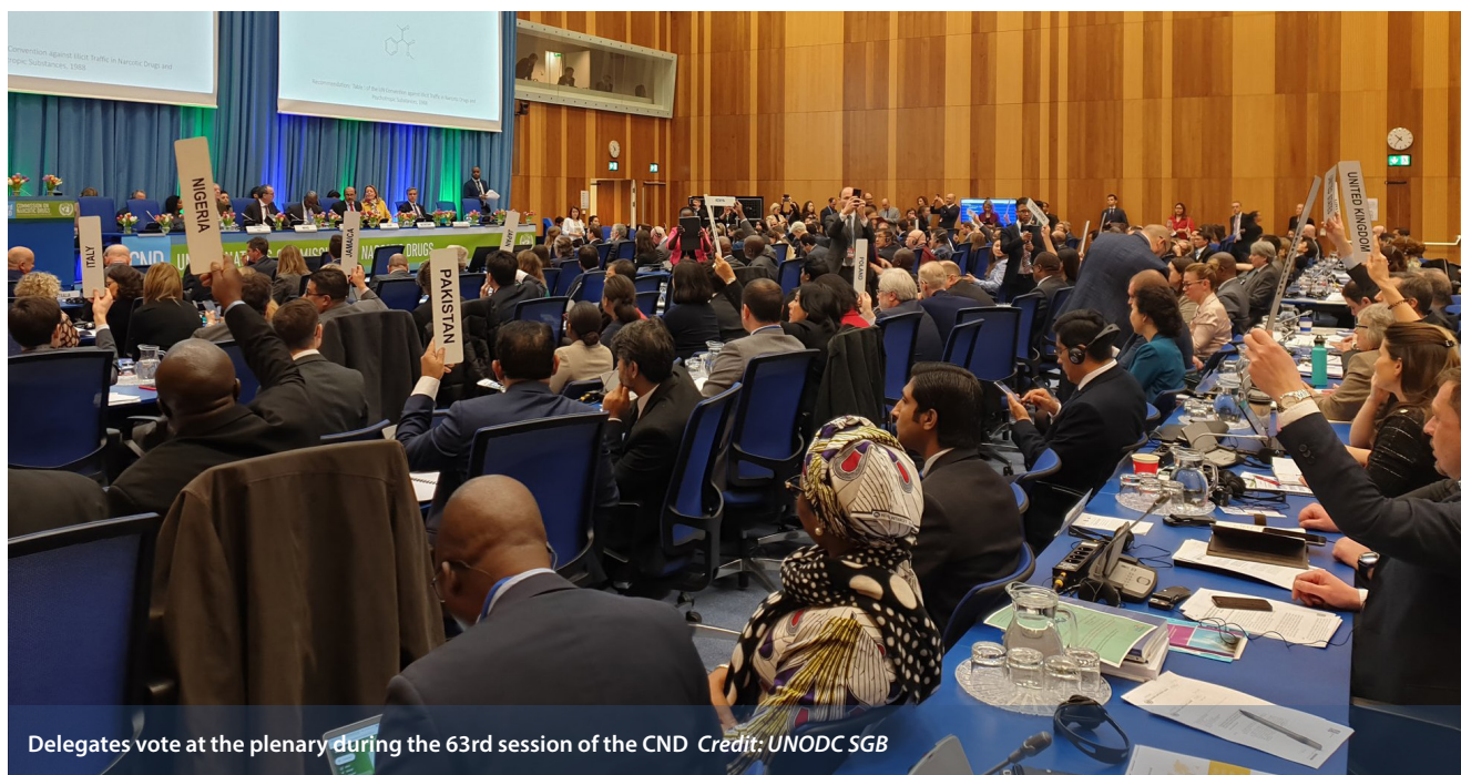
Delegates vote at the plenary during the 63rd session of the CND