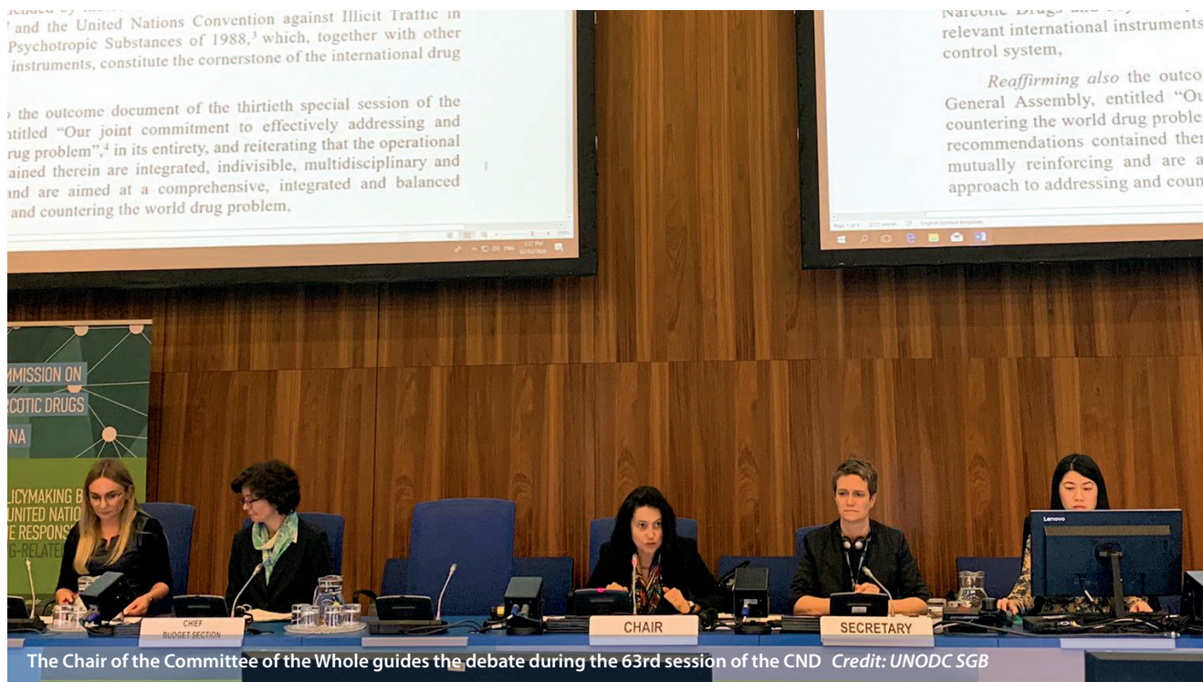
The Chair of the Committee of the Whole guides the debate during the 63rd session of the CND

The final paragraphs to be agreed generated some debate, particularly regarding language surrounding welcoming the UN Toolkit on Synthetic Drugs and the UNODC's Opioid Strategy, and the importance of the INCB's global communications platforms 28 (See Preambular Paragraph – PP – 14). Alternate proposals had been suggested by the Russian Federation, Canada and Mexico, with Russia's proposed language seen by others as 'tight' as it focussed on giving instructions to the INCB and highlighting the collaboration between the UNODC and the INCB, whilst Canada's text was focused more on coordination between authorities. Much time was consequently devoted to the use of the words 'coordination',