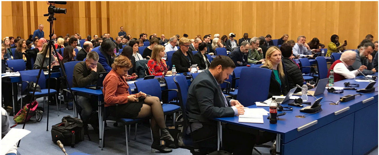
Civil society gets ready for an Informal Dialogue with WHO officials