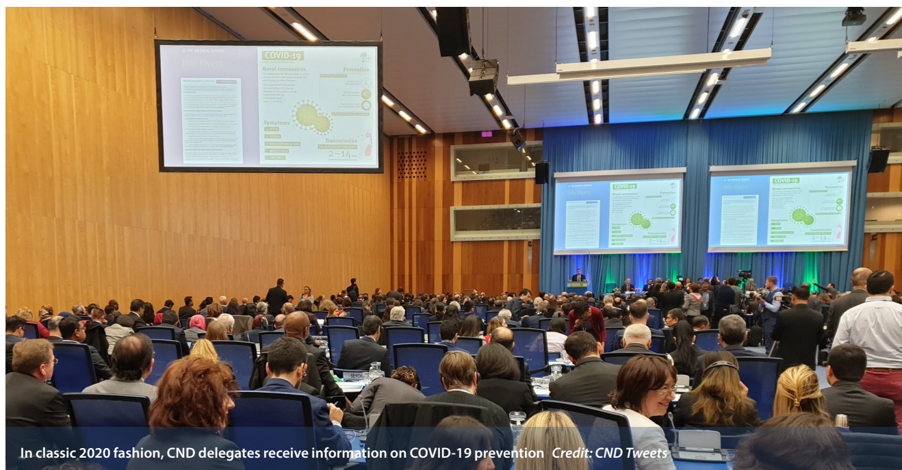
In classic 2020 fashion, CND delegates receive information on COVID-19 prevention

As might be expected bearing in mind the positions adopted in the General Debate, the country statements that followed once again fell broadly in two camps; states that favoured and those that regretted yet another postponement. Indeed, as can be seen, many of the positions reaffirmed those made earlier in the week. Arguably leading the regretful group was the EU, with among other states, Mexico and Uruguay associating themselves with the European Union’s statement. This, like all other interventions, expressed gratitude to the Chair, but while expressing acceptance of the postponement, regretted the lack of vote and noted how it must take place in December. At that point, it was stressed, the CND ‘must act to preserve integrity and credibility of international scheduling system’. Other notable statements predominantly sharing this perspective came from Jamaica, which linked