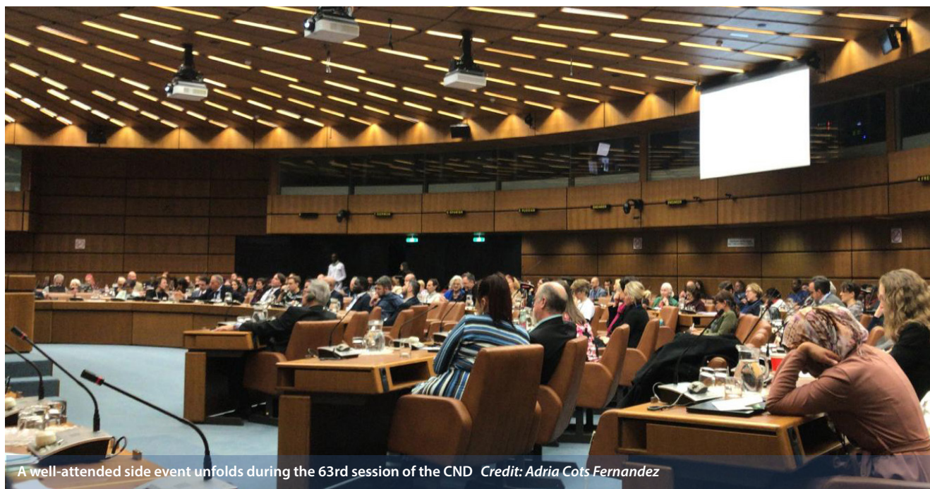
A well-attended side event unfolds during the 63rd session of the CND