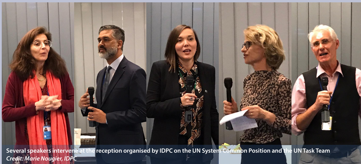
Several speakers intervene at the reception organised by IDPC on the UN System Common Position and the UN Task Team

representative pointed out how 'under the leadership of the UN Secretary General, the UN system is united on decriminalisation'. She then went on to note that 'the UN System Common Position on drug policy commits all of us to step up our joint efforts, including to end the criminalization of drug possession for personal use and call for changes in laws, policies and practices that threaten the health and human rights of people'. Significantly, and standing as a much welcome example of increasing system-wide coherence and engagement within the CND of non-traditional actors, decriminalisation was also – if more obliquely – mentioned in the statement by the OHCHR's Working Group on Arbitrary Detention. Participating in the CND for the first time, the Group's then Vice-Chair and now Chair, Leigh Toomey, stressed in the General Debate that 'the principle of proportionality must continue to be a guiding principle in drug-related matters. Criminalization of drug use or consumption and minor drug offences should be avoided by all States'.