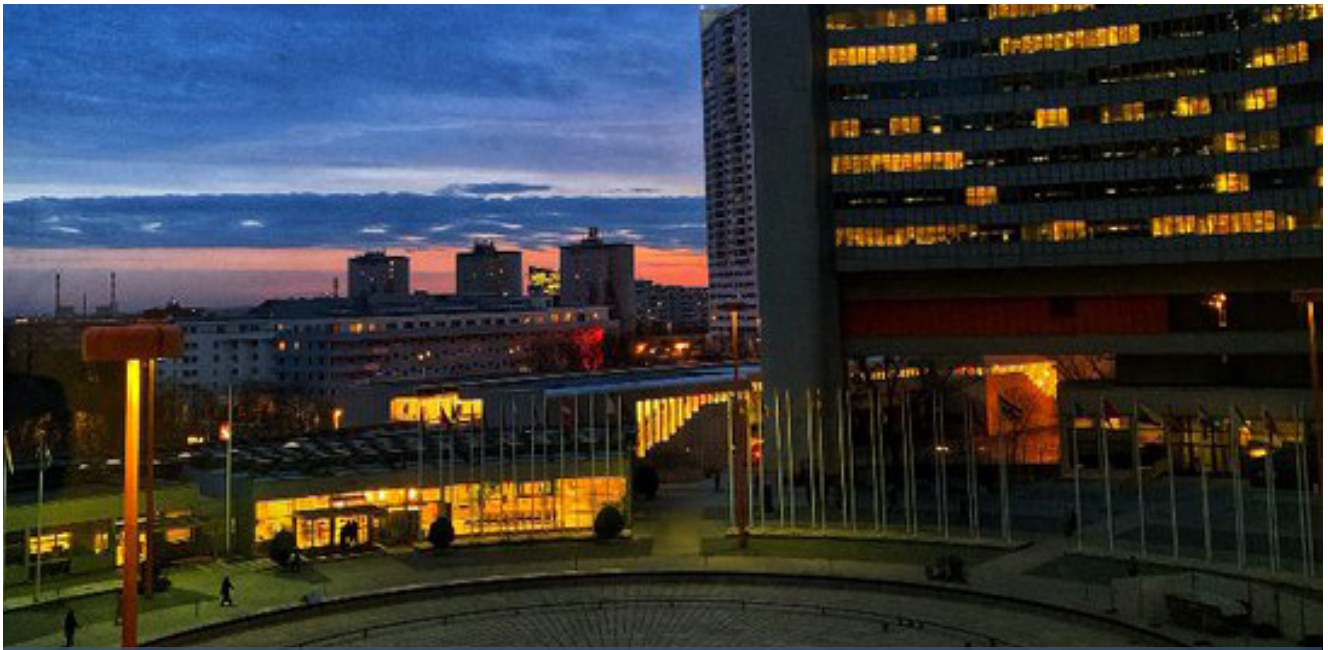
Dusk sets beyond the UN complex in Vienna as the 63rd session of CND unfolds

was also replicated in the relevant Preambular Paragraph of L4. In the end, the preambular paragraph of resolution L3 took note of the efforts of the UNODC to coordinate and ensure effective UN inter-agency collaboration, and in the operative paragraph, requested the UNODC brief member states on a regular basis on their efforts to coordinate and ensure effective UN inter-agency collaboration.