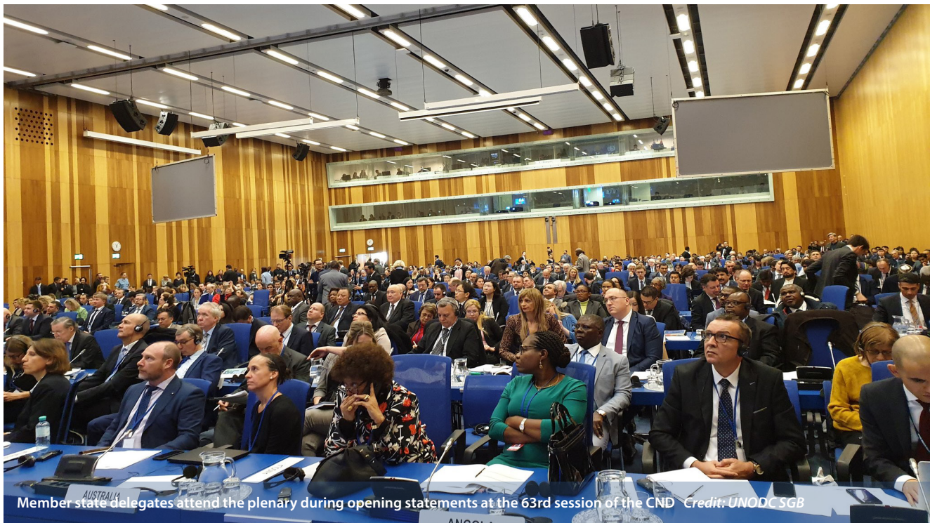
Member state delegates attend the plenary during opening statements at the 63rd session of the CND

designed for mutual reinforcement, the video in many ways presaged the opening statement from the new UNODC Executive Director, Ms. Ghada Fathi Waly.