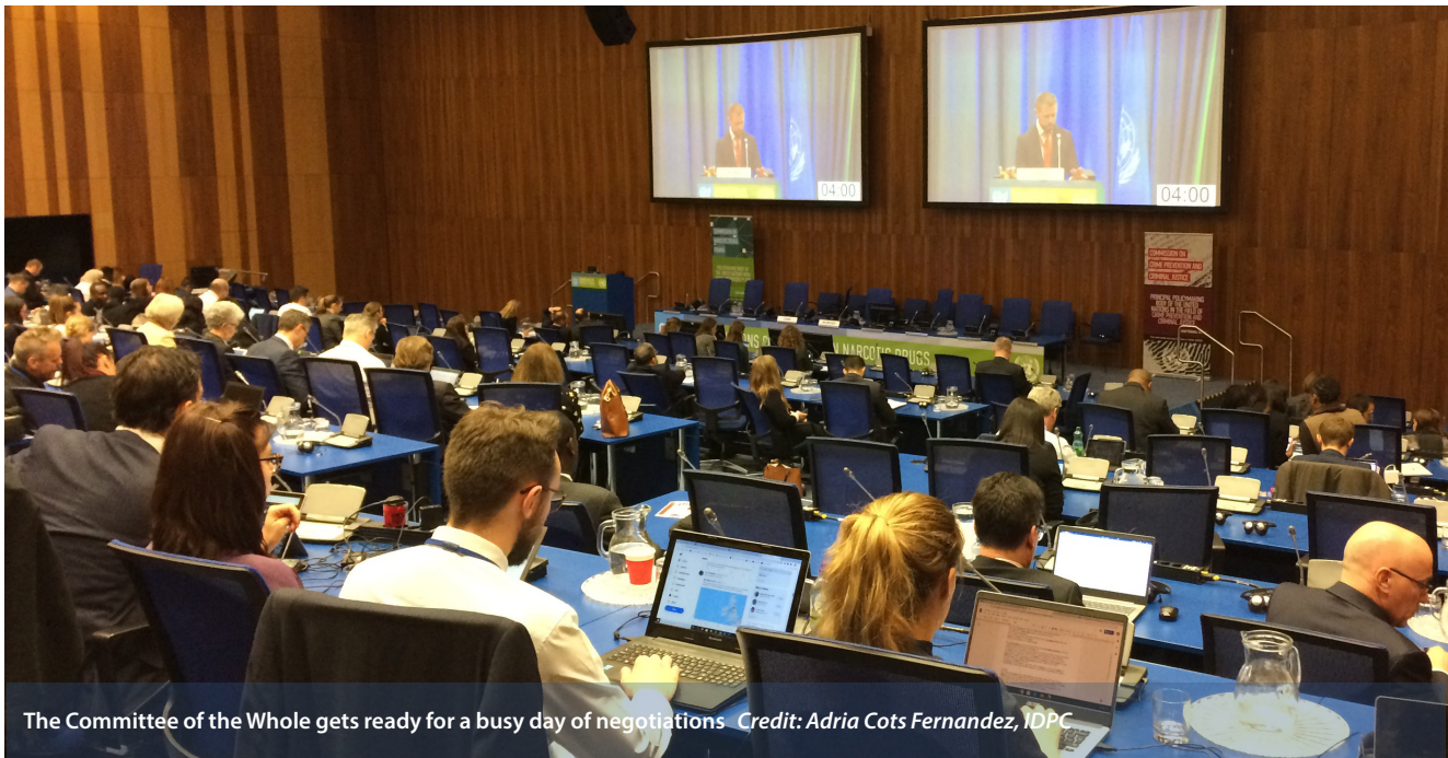
The Committee of the Whole gets ready for a busy day of negotiations.