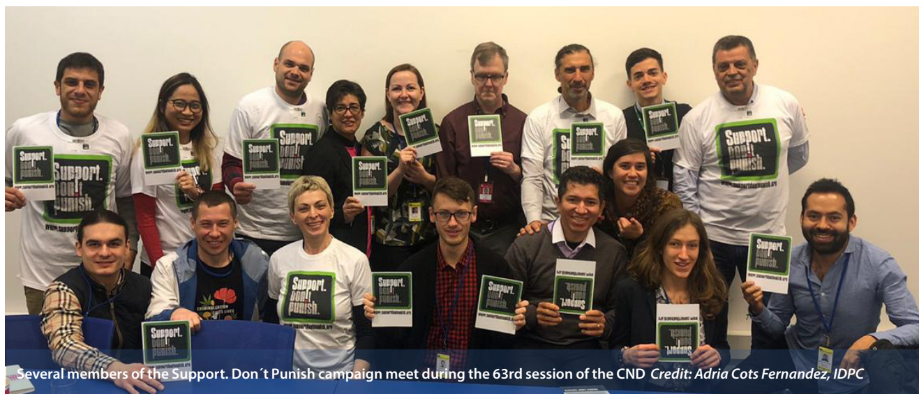
Several members of the Support. Don't Punish campaign meet during the 63rd session of the CND