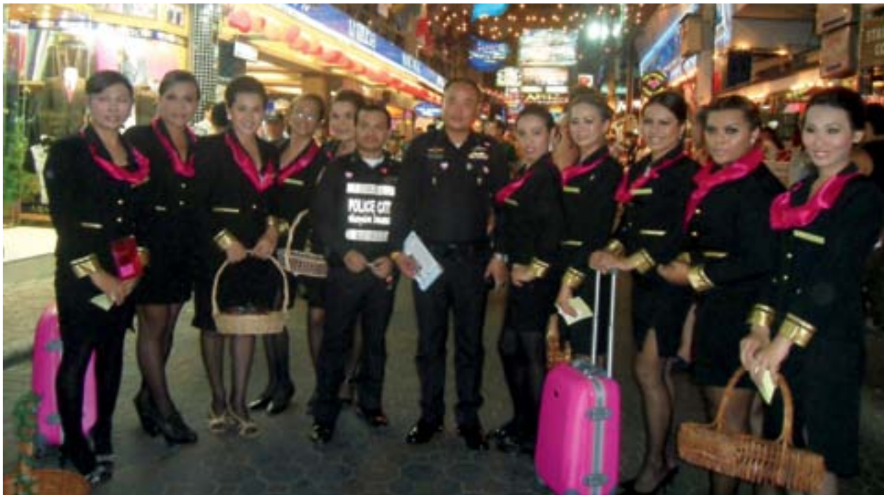
Sisters works with law enforcement officers to reduce transgender-related stigma, discrimination, and violence.

Results from PSI's cross-sectional surveys of TG people in Pattaya in 2005, 2006, and 2009 show an increase in HTC uptake, awareness of available HIV services, and awareness of Sisters and its work (Pawa, Jittakoat, and Mundy 2009; PSI 2005, 2006, 2009). There was also an increase in those who had ever been tested for HIV from 68 percent in 2006 to 77 percent in 2009, and a significant increase in those