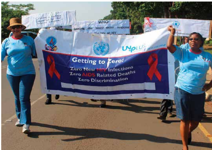
UNDP is helping Malawi create an enabling environment so that national responses are more effective.

Supporting countries to implement the recommendations of the Global Commission on HIV and the Law