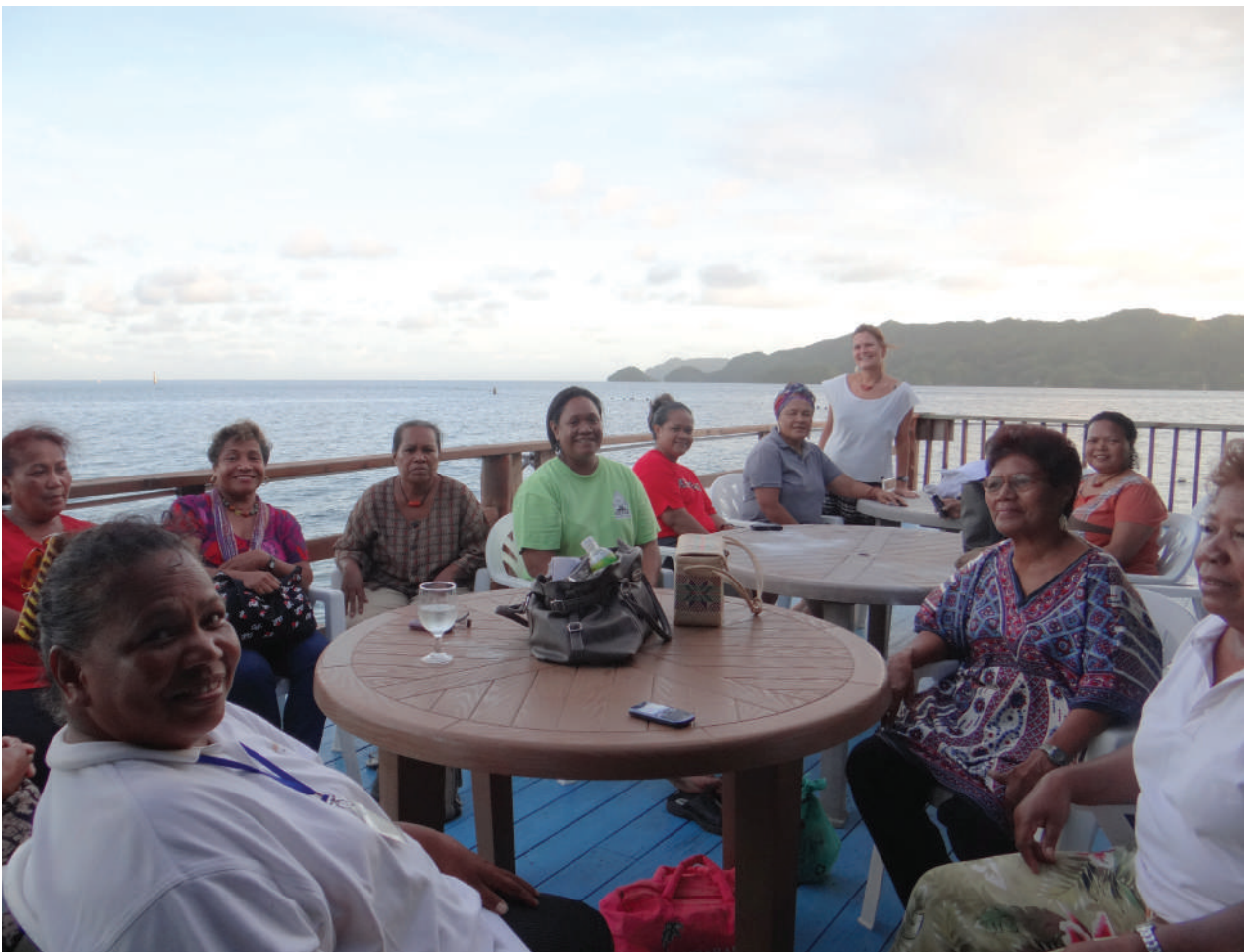
The team of violence against women survey interviewers in Palau

“[The interviewer] comes back [from an interview] and says, ‘I’ve been talking about [the interviewee’s] stories for the past however many hours’. And really, the interview might have taken 30 minutes to an hour, but [the interviewee] was just talking, talking, talking. Most [interviewers] just let them talk, I think because we are a smaller population and the [interviewers] realised there was a big need for support out there. Just being able to talk to other women.”