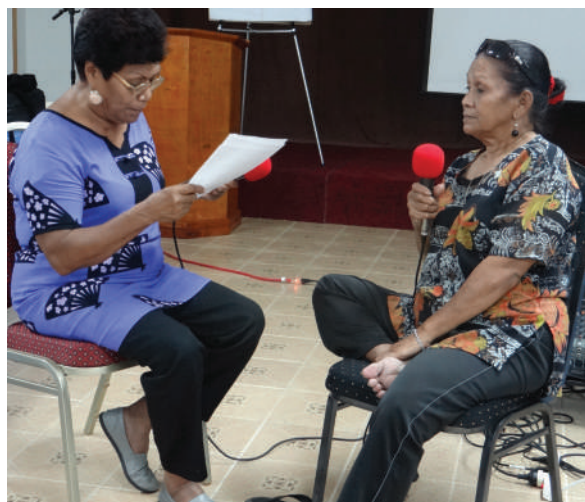
Violence against women survey interviewers practice interviews in Palau

“The methodology encourages you to pre-test the questionnaire, so we did some pre-tests. But I think where I received a lot of resistance or acceptance of certain changes to the questions was from the translators, because they were women in the community.”