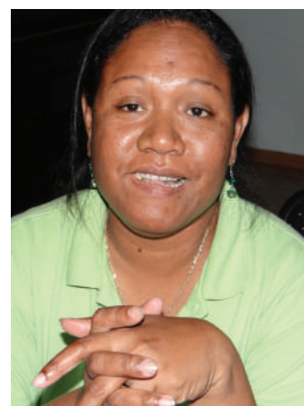
Violence against women survey interviewers in Palau