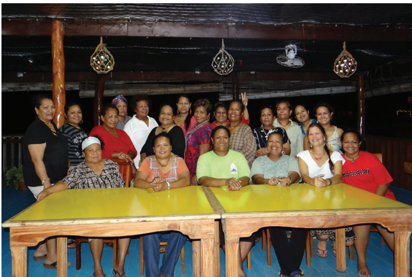
The team of violence against women survey interviewers in Palau