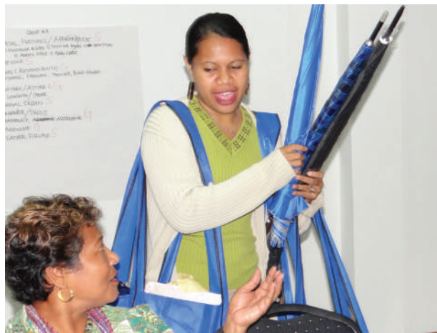
Violence against women survey interviewers in Palau