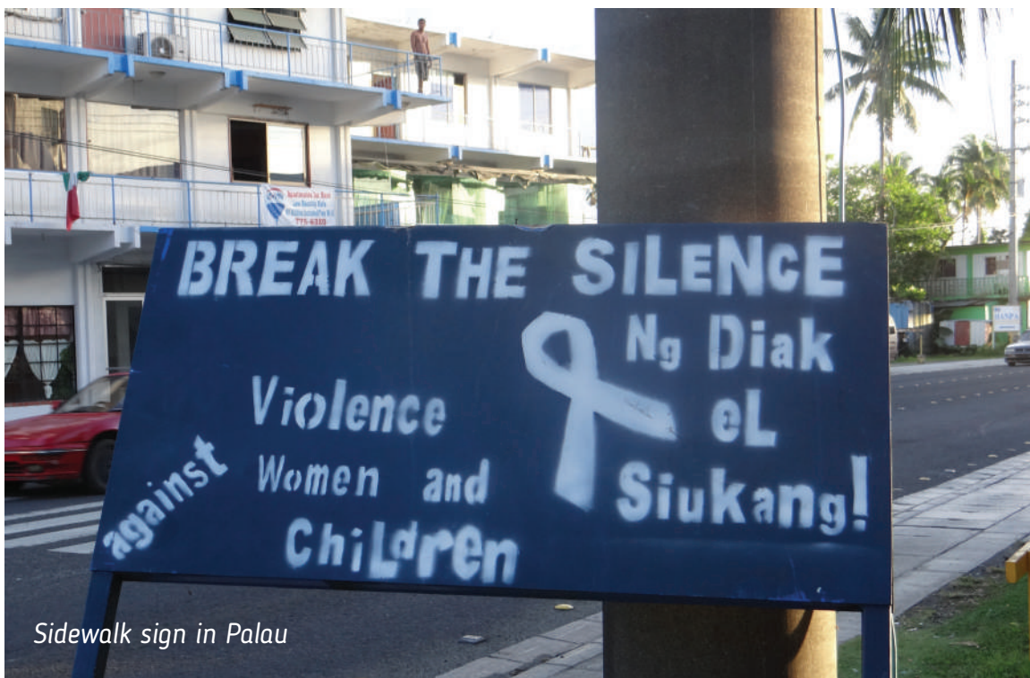
Sidewalk sign in Palau