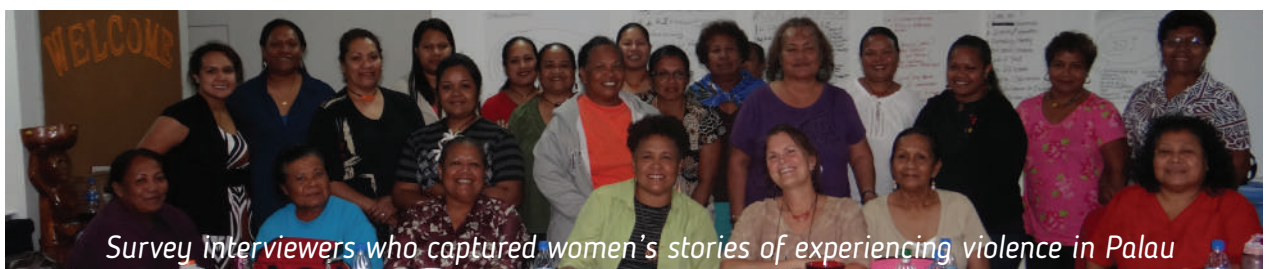
Survey interviewers who captured women's stories of experiencing violence in Palau