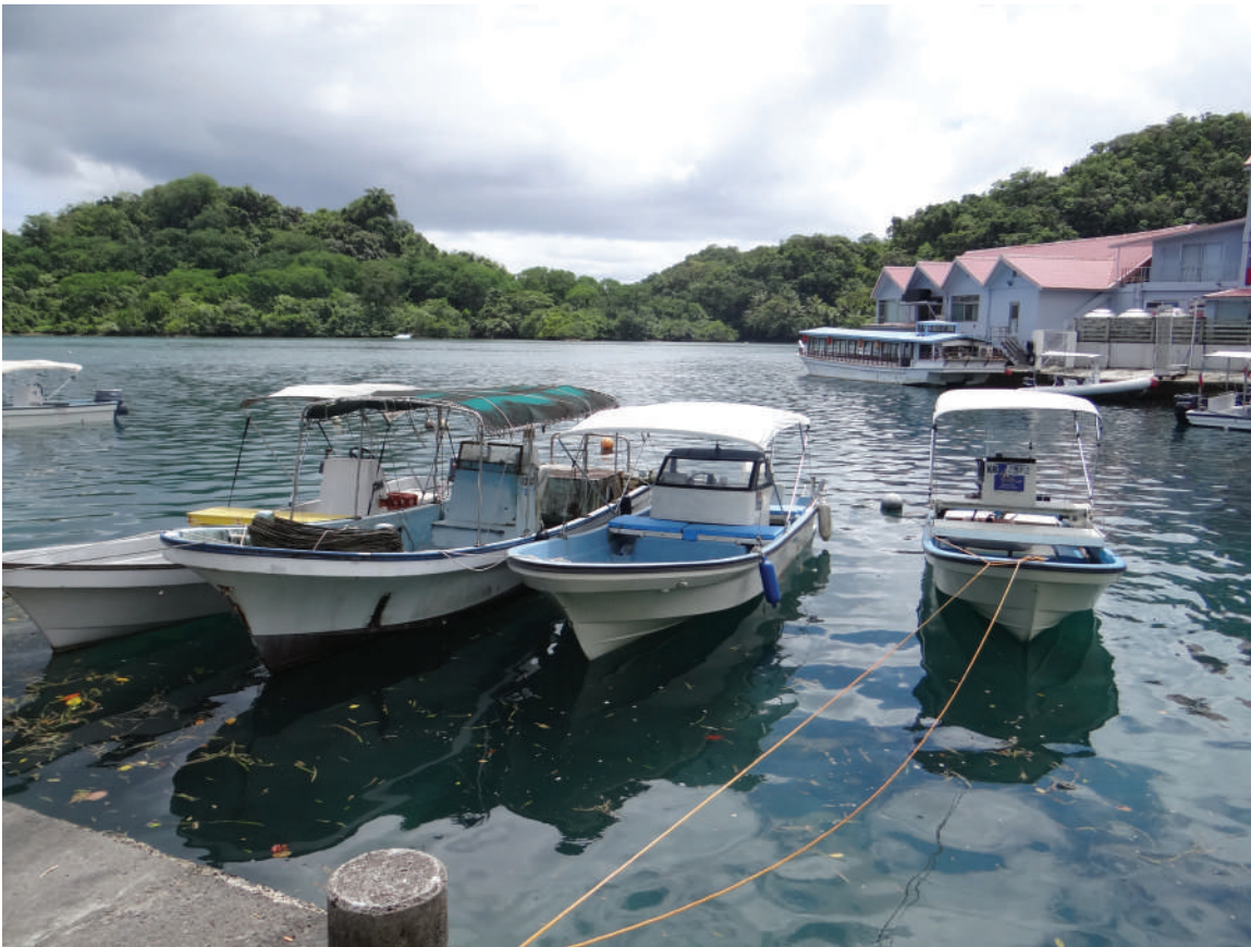
Boats sitting in a marina in Palau

[Another complexity] was working with other [people], because I couldn’t force them to come back with the things I needed. So really the timeline changed and extended.”