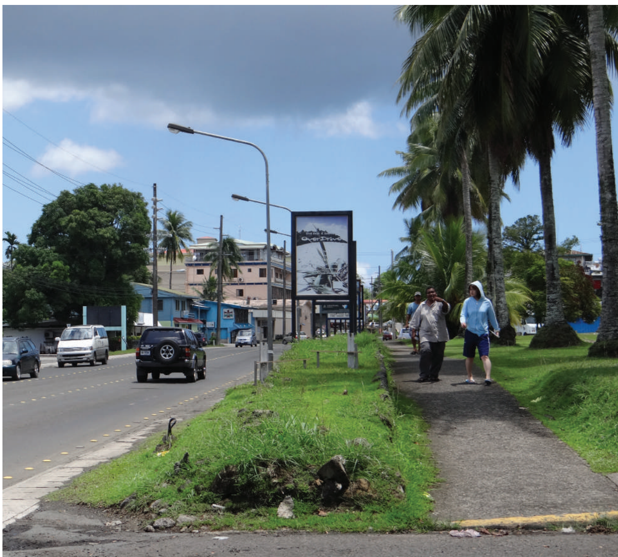
Urban area in Palau