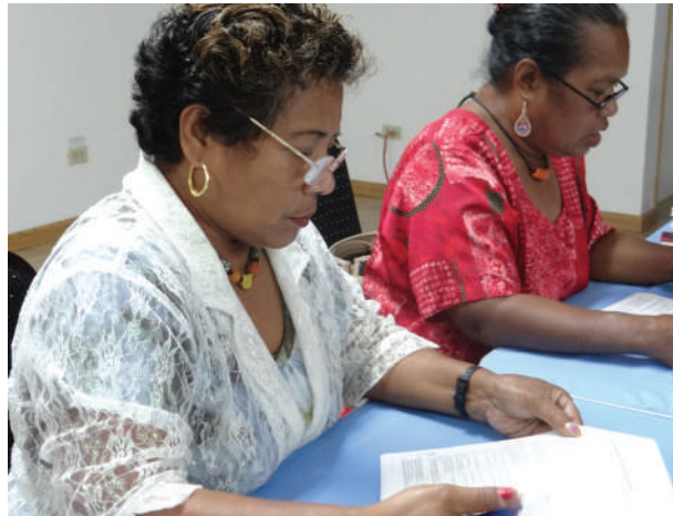
Above and below: Violence against women survey interviewers in Palau

“We randomly gave [interviewers] the households [to interview]. But of course being a small country, when [the interviewers] went through their household listings, they knew people so they would just switch between themselves because some [interviewees] were acquaintances or relatives. Yeah, it’s a really small country. There were certain situations where an interviewer would go to a household once or twice [to set up an interview], and they would get ‘the cold shoulder’ or the [interviewee] was not quite willing to participate. [In these cases] we would ask the supervisor to go and talk to [the interviewee] or call them [to encourage participation in the interview]. Or if one of the other interviewers knew the [interviewee], they would go and talk to [the interviewee] or call them up. That helped.”