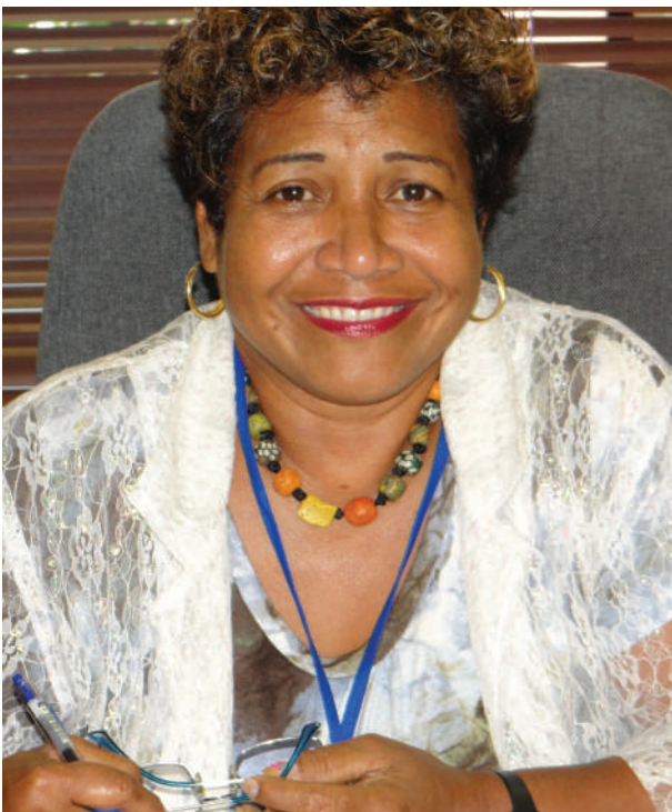
Palau violence against women survey interviewer