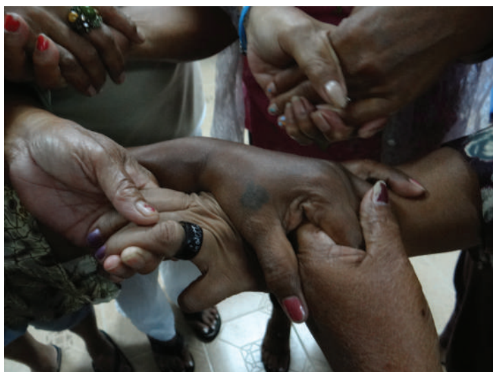
Women join hands in Palau

“It was fun...And stressful; I gained eight pounds. But it’s so rewarding. I would totally do it again. When it first started I thought, ‘Oh my, this is going to be the most intense, saddest thing. I’m just going to be crying’. But I realised there are some moments that are really fun. It was really fun. I learned a lot about being a Palauan woman. The things we shouldn’t do or should, and some of the myths that have been perpetuating this kind of behaviour: domestic violence and not empowering the women.”