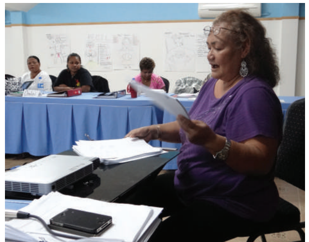
Interviewer training for the Belau Family Health and Safety Study