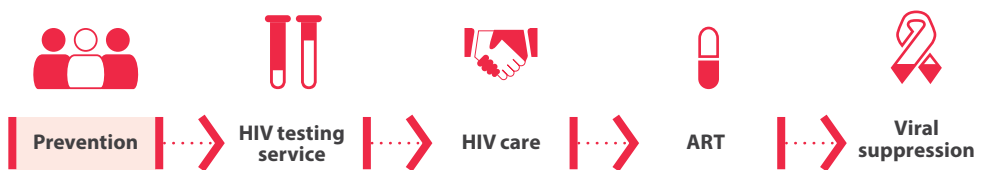
Figure 1. HIV SERVICE CASCADE