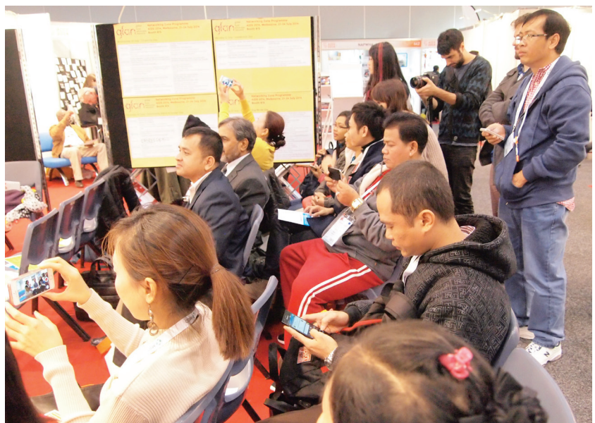
Participants from Asia and the Pacific discuss the crucial community involvement in the country dialogues at the Global Fund Advocates Networking Zone at AIDS 2014, Melbourne, Australia.