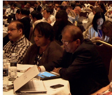
Participants at the Global Fund South and East Asia Workshop “Achieving Impact: The New Funding Model Update”, 16-18 June 2014, Phnom Penh, Cambodia.

Once approved, grants will begin to be implemented for an implementation period of 3 years.