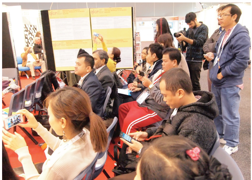
Participants from Asia and the Pacific discuss the crucial community involvement in the country dialogues at the Global Fund Advocates Networking Zone at AIDS 2014, Melbourne, Australia.