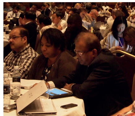
Participants at the Global Fund South and East Asia Workshop “Achieving Impact: The New Funding Model Update”, 16-18 June 2014, Phnom Penh, Cambodia.

Once approved, grants will begin to be implemented for an implementation period of 3 years.