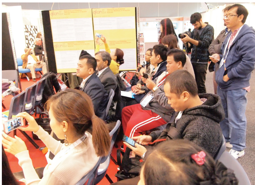
Participants from Asia and the Pacific discuss the crucial community involvement in the country dialogues at the Global Fund Advocates Networking Zone at AIDS 2014, Melbourne, Australia.