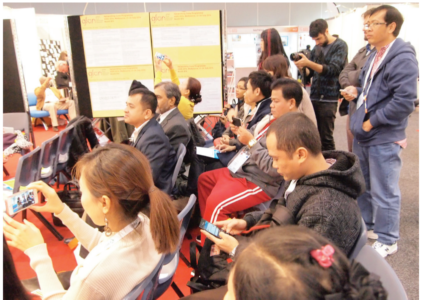
Participants from Asia and the Pacific discuss the crucial community involvement in the country dialogues at the Global Fund Advocates Networking Zone at AIDS 2014, Melbourne, Australia.