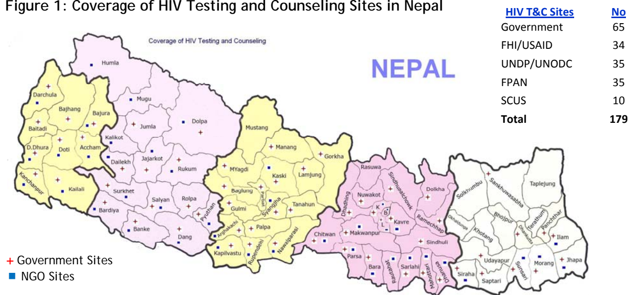
Figure 1: Coverage of HIV Testing and Counseling Sites in Nepal