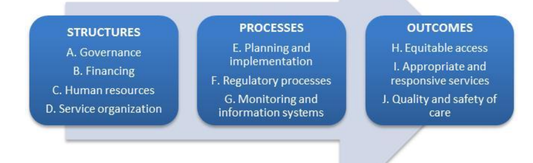
Figure 4- PRIMASYS framework of structure, processes and outcomes of primary care systems (adapted from Kringos et al. 2010)

Indeed the proximate structures that contextualize and condition the nature and availability of primary care services represent different parts of the broader system into which primary care must be integrated for it to function optimally. (Conversely many of the failures of primary care services are attributable to problems in integration within the system).