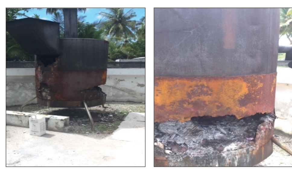
Burner in Fuvahmulah Atoll Hospital