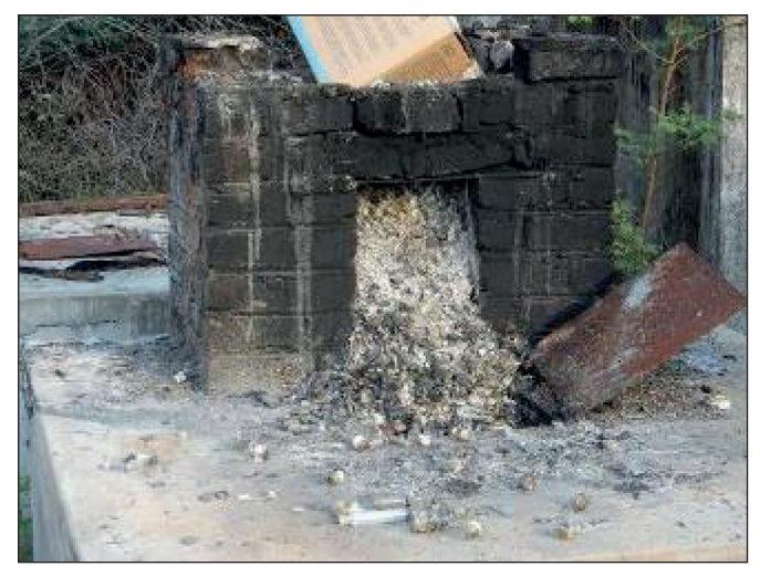
Low Temperature Brick incinerator used for burning syringes