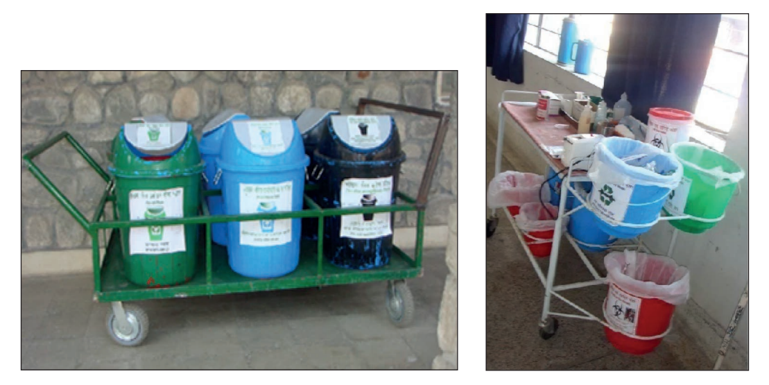
Color coded waste collection trolley in Western Regional Hospital Pokhara