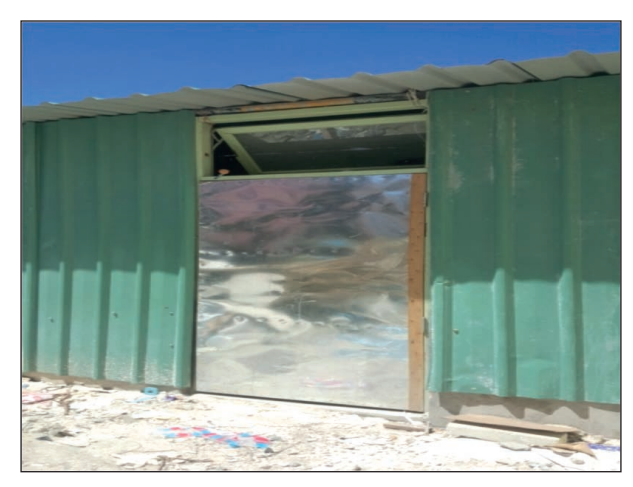
Storage area of Hulhumale Hospital