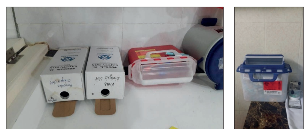
Sharps collection at Hithadhoo regional Hospital