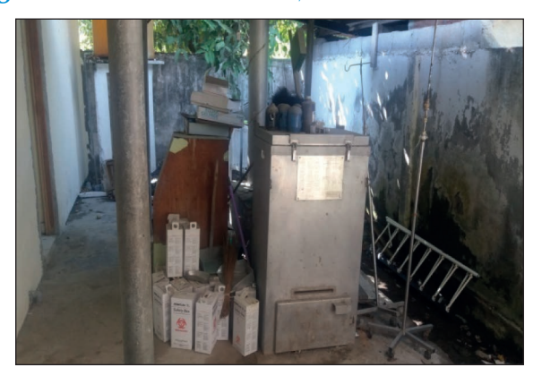
Figure: Incinerator Manatuto, which is not functional

These are the hospitals that offer primary health care such as first aid with preliminary and on rare occasions, birth delivery. Most of the facilities come under an Integrated Development of Community Health Services (SISCA) scheme. The Community Health Centre of Manatuto municipality has an incinerator but it is not functional.