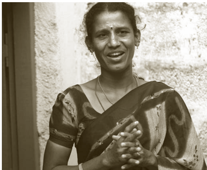
Date original created: 28 March 08 Country: India

However, in the last decade or so, activists in the women's movement have been advocating for the need to address gender issues, including violence against women, in the fight against HIV&AIDS. As more and more women and girls have contracted the disease and its sociocultural and human rights implications have become more widely known, awareness of the linkages between the pandemics has increased. Promising practices facilitate linkages between advocates and activists within the two movements, and strengthen their capacity to work together.