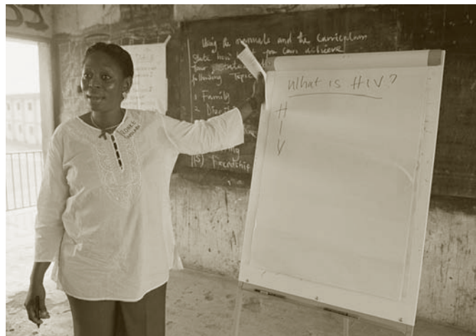
Country: Nigeria

Together We Must! is organized around four broad-based strategies for tackling the intersection: community mobilization to transform harmful gender norms; engagement of marginalized groups that are often more vulnerable to the twin pandemics; development of integrated approaches to support and care; and advocacy for greater accountability among funding agencies and policy makers. Together, these strategies offer valuable lessons and promising practices for