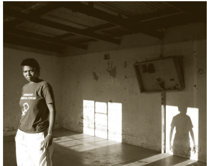
Date original created: 26 January 09 Country: South Africa

The remaining chapters lay out four broad strategies for confronting the intersection of VAWG and HIV&AIDS that emerge from the profiles. Chapter 2 illustrates the importance of involving multiple stakeholders, from men and boys to families and social networks, in strategies to confront the twin pandemics as a means of fostering community mobilization and support. Chapter 3 focuses on the importance of involving marginalized groups in and throughout the programme cycle, from design and implementation to monitoring and evaluation, and examines the ways in which organizations are addressing the impacts of race, class, sexual orientation and age in their work at the intersection of the dual pandemics. Chapter 4 looks at innovative models of health care that integrate sociocultural factors in their care and support, while Chapter 5 examines strategies for using research, advocacy and documentation to hold policy makers accountable. The report closes with five recommendations that emerge from the promising strategies profiled. These recommendations are aimed at governments, civil society groups, individuals and others who might consider similar strategies in their own programming efforts to confront the intersection between VAWG and HIV&AIDS.