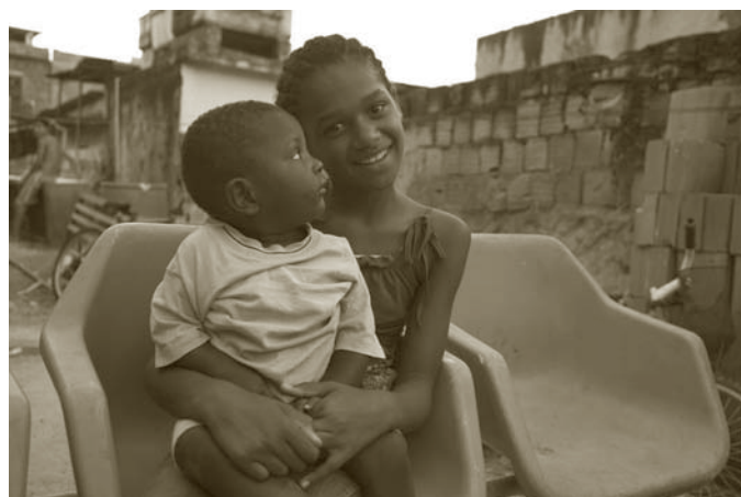
ActionAid/UK branded image Date original created: 29 April 09 Country: Brazil