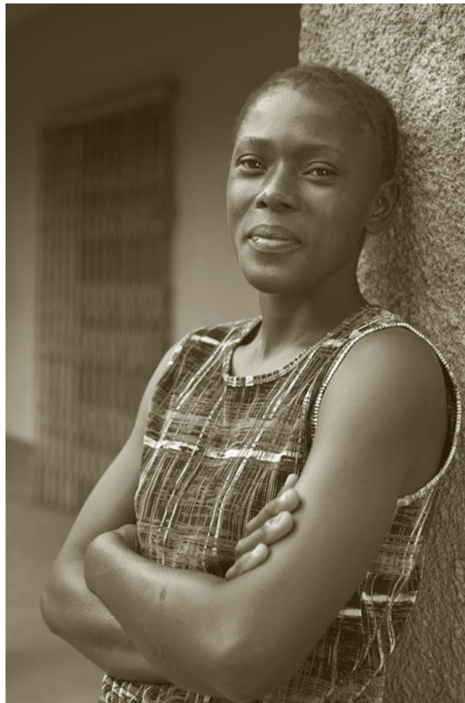
Date original created: 29 September 08 Country: Kenya

The examples detailed here provide two promising models for an integrated approach to addressing the dual pandemics. The first, a 'one-stop shop' for survivors of sexual violence, illustrates a rights-based approach to health care whereby women receive free treatment, care and support in the face of violence and HIV, as well as assistance in doc-