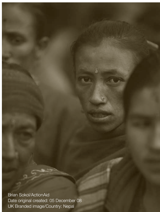
Date original created: 05 December 08 UK Branded image/Country: Nepal

Much like Safe Migration programming, Equal Access makes efforts to ensure that 'VOICE' reaches underserved communities. In addition to broadcasting in Nepal and among Nepali migrants in India, a tailored version of the radio programme is recorded on audio tapes that are distributed among transport workers, long-route bus drivers and for use at major transit points such as border crossings. Furthermore, as a means to strengthen community ownership and ensure sustainability, Equal Access partners with local NGOs to assist in outreach and monitoring of