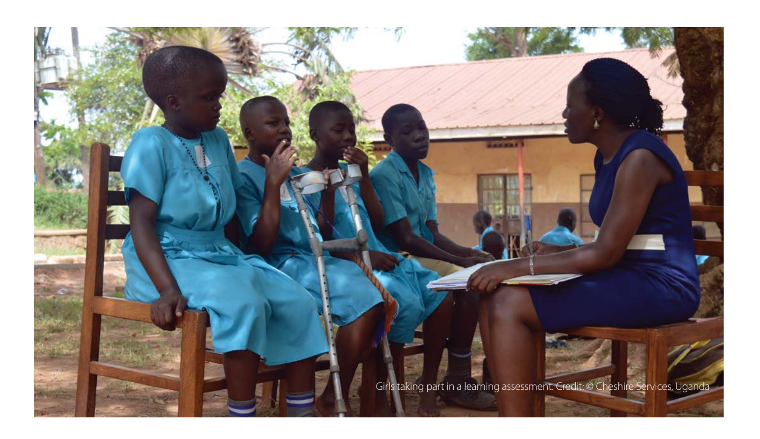
Figure 1: In 15 Commonwealth countries, a girl from a poor rural household has no more than five years of schooling

Mean years of schooling by group as reported by 20-24 year olds