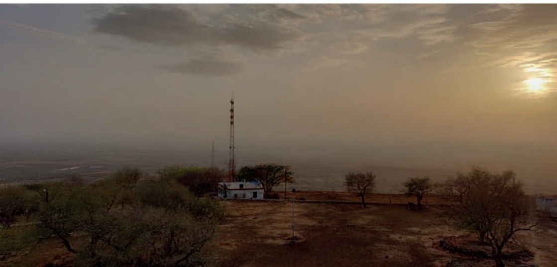
Ahmednagar, India, 2019.

Starting in 2006, TAAL was providing services to two to three people a month; this increased, and over the next two years, TAAL saw more than 12 000 people. Around this time, the Government of India was slowly scaling up its free antiretroviral therapy programme, and TAAL expanded along with it, opening an additional three pharmacies (in Ahmednagar, Kalyan and Nagpur) in response to regional demands for reduced travel costs and increased access.