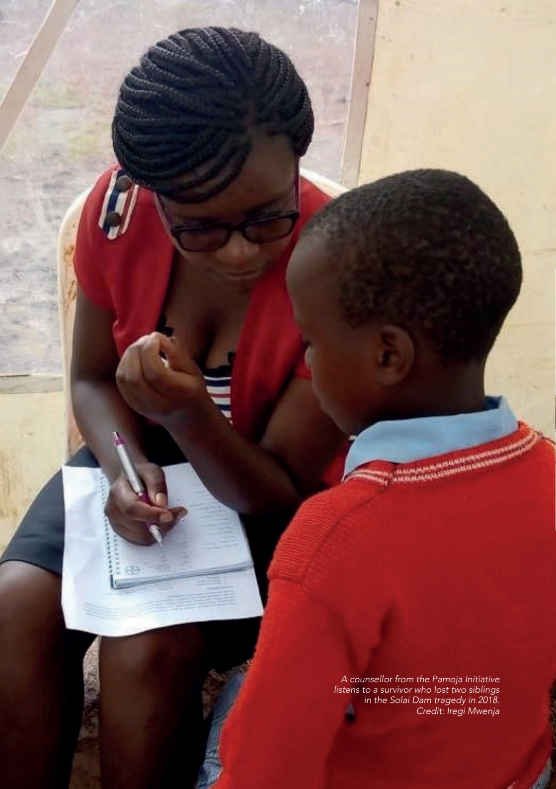
A counsellor from the Pamoja Initiative listens to a survivor who lost two siblings in the Solai Dam tragedy in 2018.