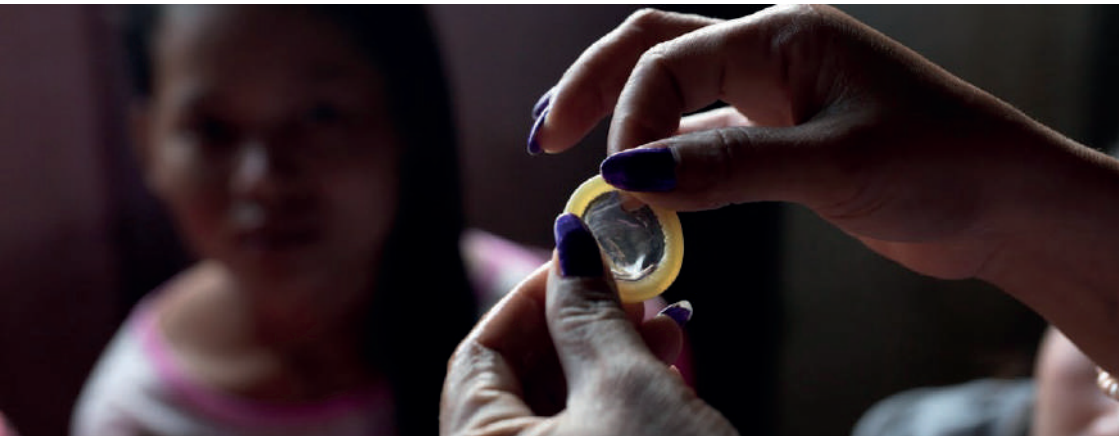
Cambodia, October 2014.

Organizations run for and by sex workers in India are galvanizing action to level the economic playing field and advance their rights. In 2007, a collective of female sex workers partnered to form the cooperative society, Swathi Jyothi. Managed and owned by women in sex work (like a credit union), Swathi Jyothi harnesses the transformative potential of microfinance, creating products and services based on an innovative service delivery model. Savings are safe and secure, and credit is easy and affordable, with no collateral required: loans are guaranteed by a common interest group and can be used for housing, children's education and other needs. The experience gained from Swathi Jyothi was made an essential part of vulnerability reduction efforts.