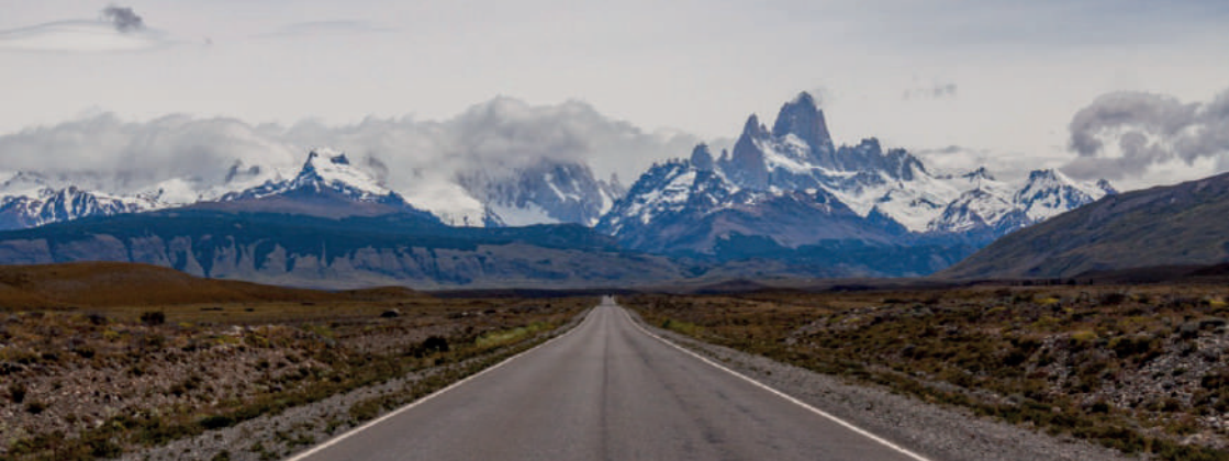
El Chanten, Argentina.

In 2014, complaints mechanisms were established that allowed people to lodge grievances and queries. HRCSD opened a free, confidential and secure 24/7 hotline (an 0800 number) through a multisectoral consultation with several ministries, government institutions and civil society organizations. 2 Phone calls were logged by issue and referred to the appropriate authority for response in collaboration with the relevant civil society organization.