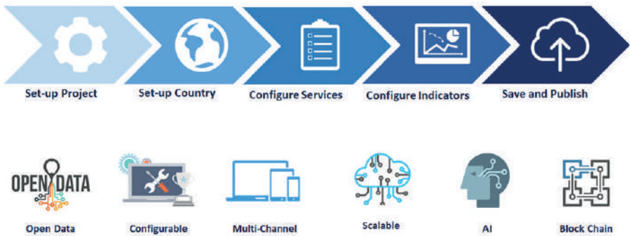
Figure 1. Work plan.

The new Smart Configuration Set-up of OnelImpact allows complete management and configuration of the platform by the user countries. The platform harnesses the ongoing advancements in technologies, including AI and blockchain, to improve accountability and programmatic outcomes dramatically, thus accelerating efforts to end TB.