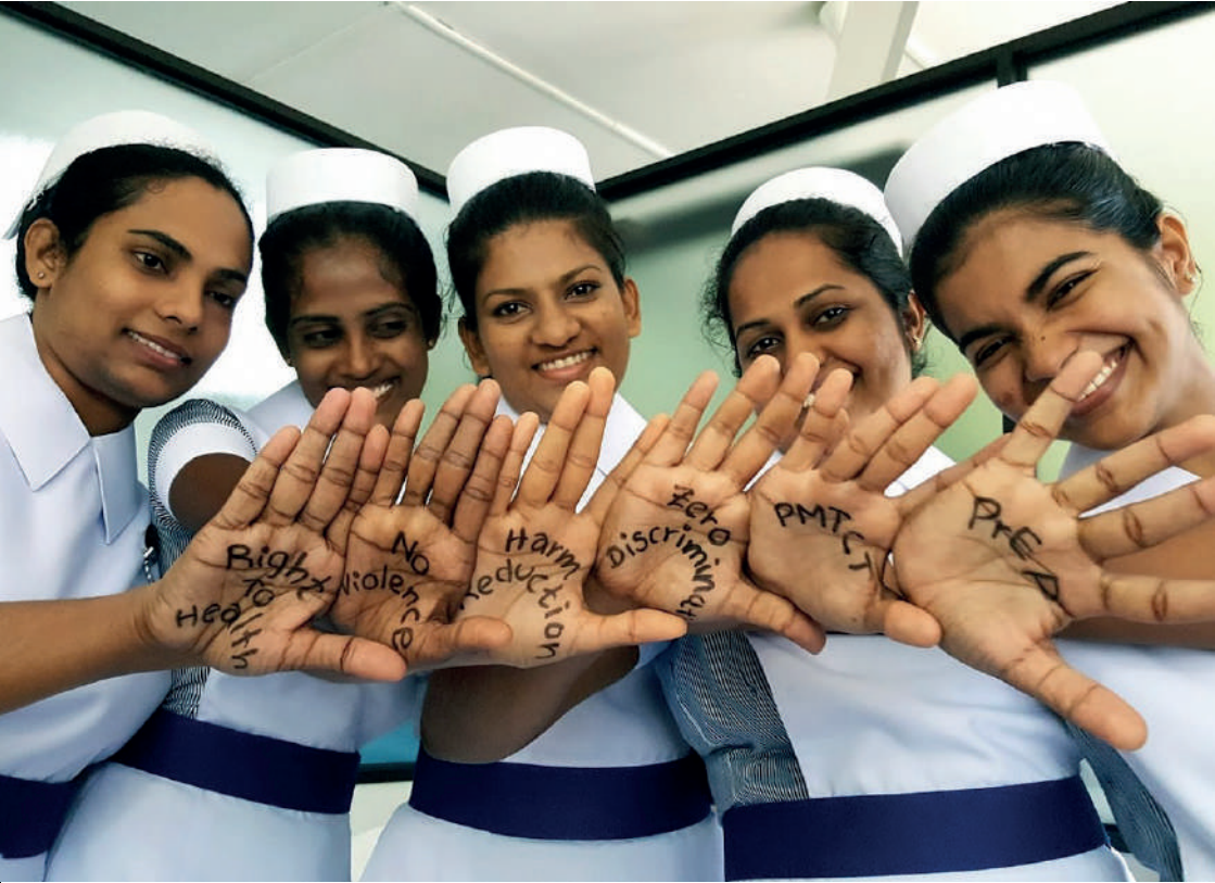
Right to health. November 2016

Swasti Jyothi's efforts include increasing and educating community members on financial literacy and planning, savings, credit, insurance and pensions. It is also seeking to enable access to civic identity credentials (formal identity and citizenship documents), an important gateway to social protection. The Swasti Jyothi programme costs only US$ 19 per person per year, and has demonstrated a social return on investment of twenty-nine times, which means that 1 US$ invested returned US$ 30 in the hands of the community.