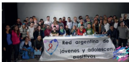
Annual General Assembly of the Network in the City of Mendoza, Argentina in 2018.

Red Argentina de Jovenes y Adolescentes Positivos (RAJAP) www.rajap.org