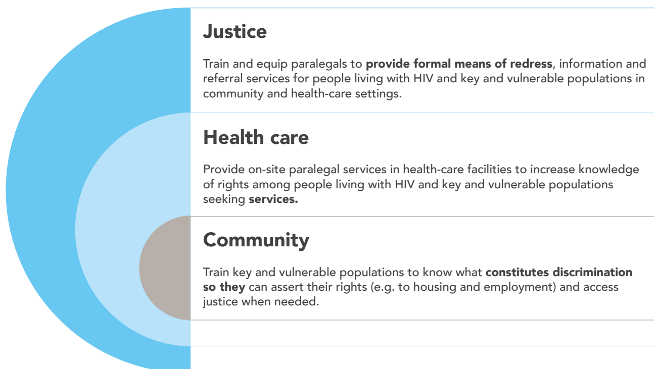
Figure 1. Increasing access to HIV-related legal services by setting: intervention examples

As an example, let us consider human rights programme 2. Figure 1 provides examples of evidence-based interventions that could be implemented in the community, health-care and justice settings to increase access to HIV-related legal services.