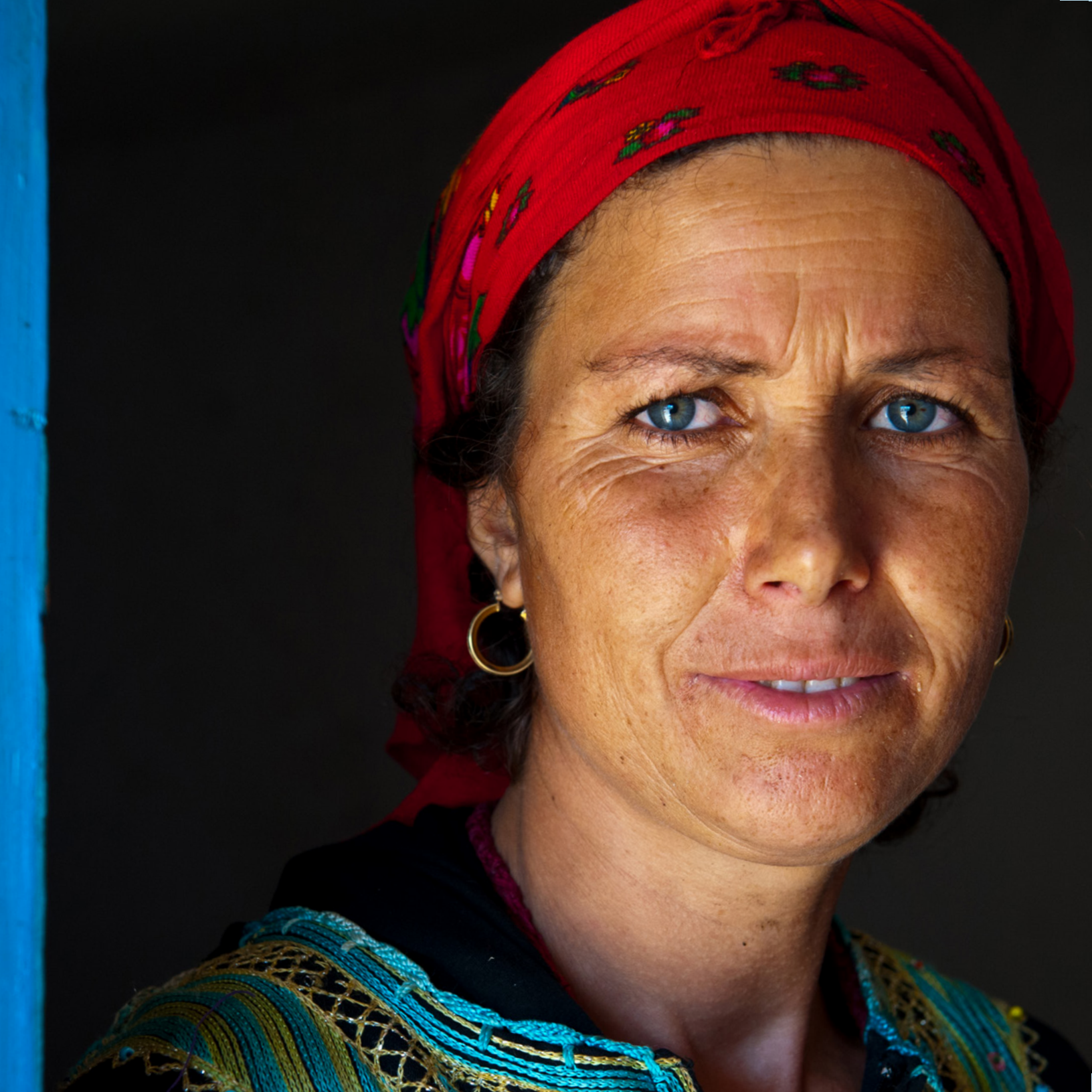
Above: Tunisia. A pottery artist based in Senjane.