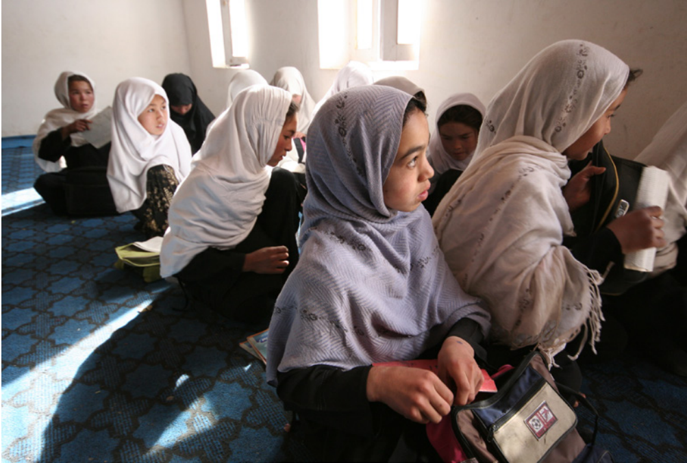
Above: Afghanistan. Students in a classroom.