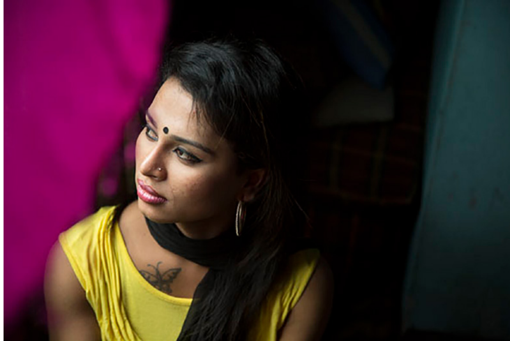
Above: Bangladesh. A transgender woman poses at her home.

Due to the availability of other resources, the Toolkit does not cover issues of transitional justice, which involve Truth Commissions and various forms of national and international criminal courts and investigative processes. 36