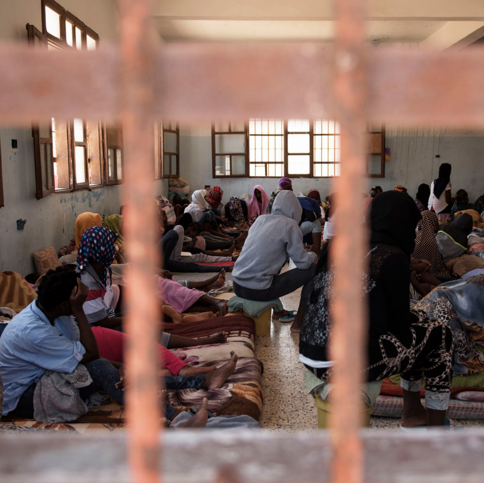
Above: Libya. Women sit on the floor in an overcrowded cell in the women's section of the detention centre for migrants in Surman.