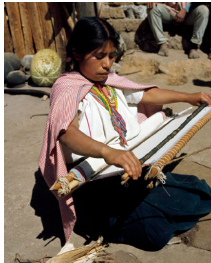
Above: President of the youth club in the village of Navenchauc weaving a cloth.

CSOs provide important services such as legal aid, education and reintegration programmes