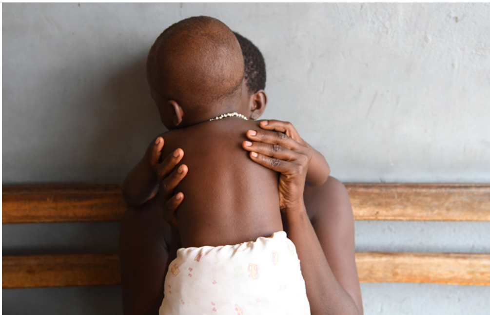
Above: Côte d'Ivoire. Woman from the village of Bouaké, holds her one-year-old son.

Criminal justice is a specialized area of the law and must be available at the right time and for all women across a State territory