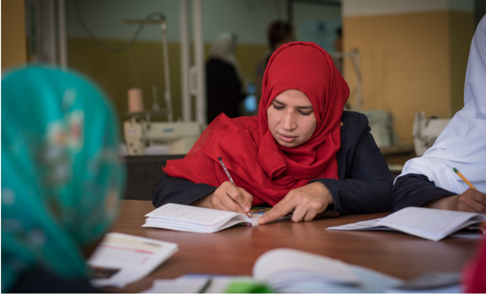
Above: Jordan. Women participate in a literacy class held at the Jordanian Women's Union center in Hitteen.