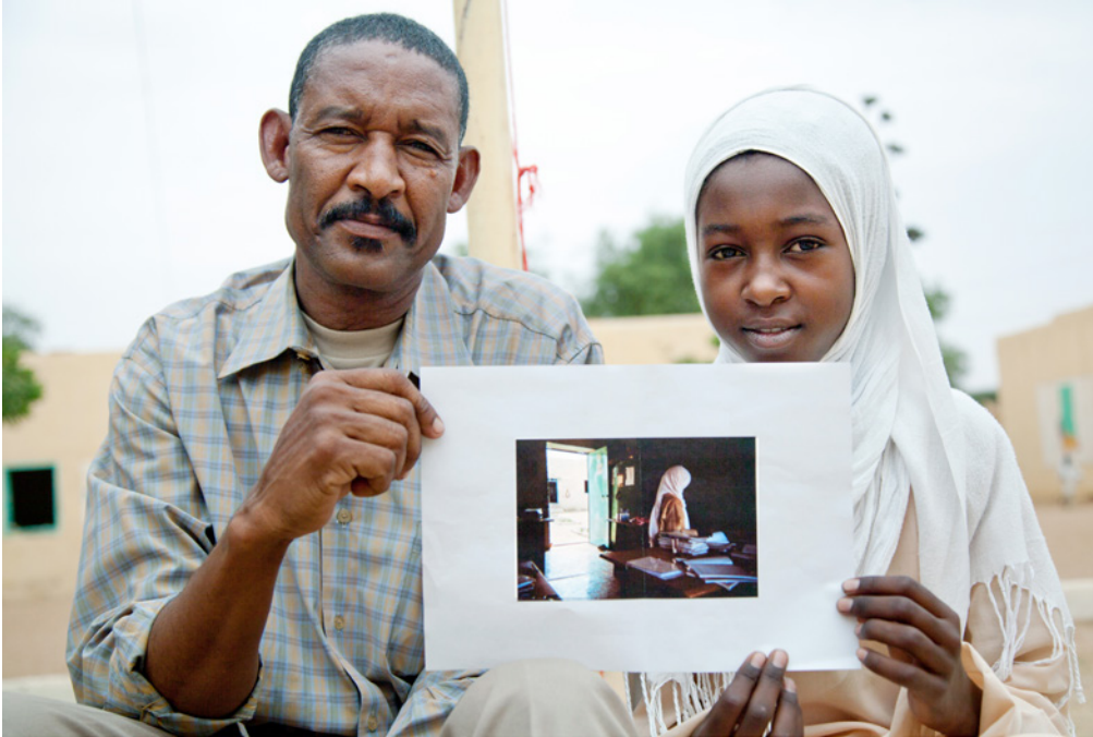
Above: Sudan. Girl wants to become a police officer when she grows up.

shall also include access to senior positions with key responsibility for the development of policies and strategies relating to the treatment and care of women prisoners.” 101 In prisons, personal searches should “only be carried out by women staff who have been properly trained in appropriate searching methods and in accordance with established procedures.” 102 It is also important for women offenders, especially those who have experienced violence and abuse, to have access to female police officers and female lawyers to reduce the risk of secondary victimization. 103 Furthermore, female lawyers can play a significant role in the provision of legal services in all legal proceedings. 104