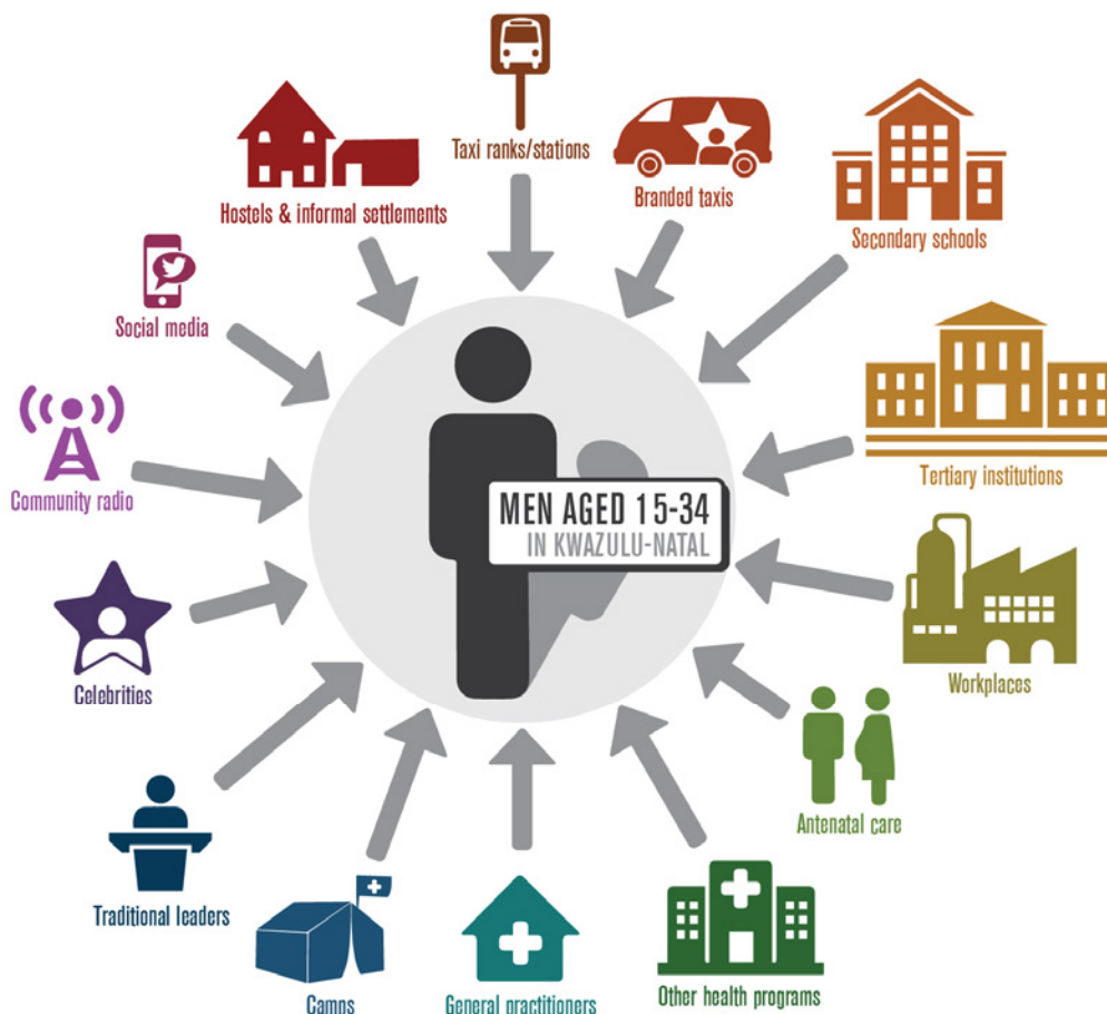
Fig. 1. Influencers of men to undergo VMMC