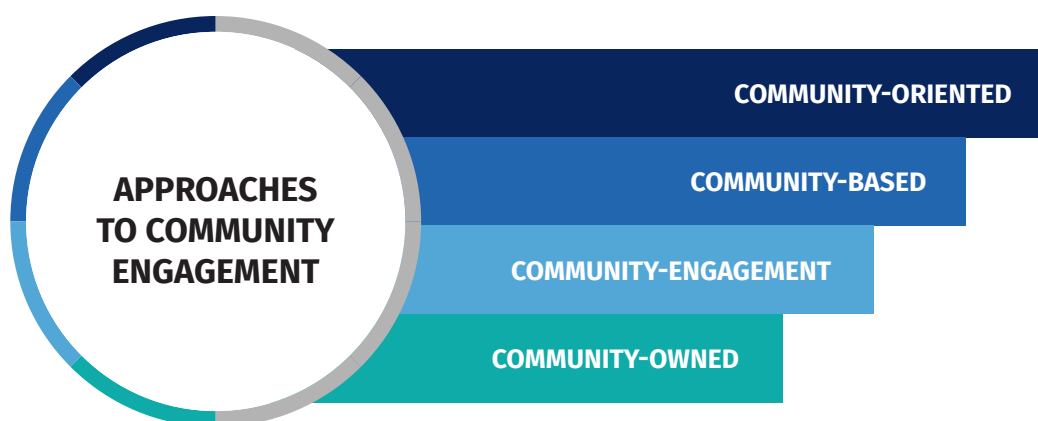
Figure 3 Approaches to community engagement

Each approach is distinct and one is not of a higher order than the other. In selecting an approach, the desired outcome should be the primary consideration. For example, in a measles outbreak, a community-oriented approach is perhaps most appropriate as the objective would be to mobilize parents to have their children vaccinated. On the other hand, in the event of a drought that requires changing of types of crops, a community-owned cooperative for seeds would be more appropriate.