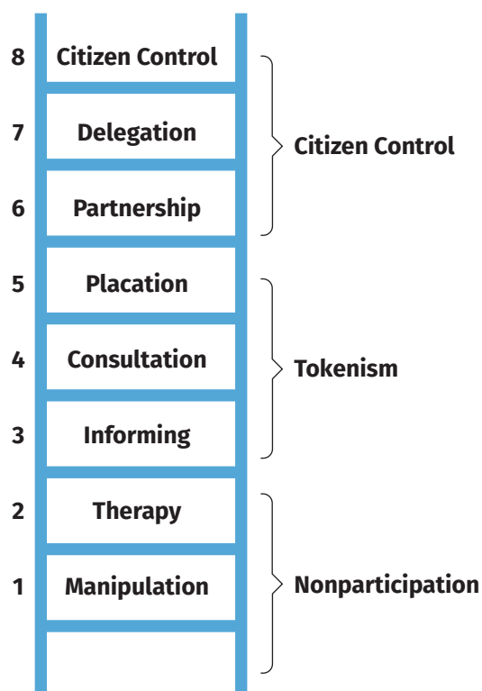
Figure 2 Arnstein's Ladder (1909) Degrees of Citizen Participation