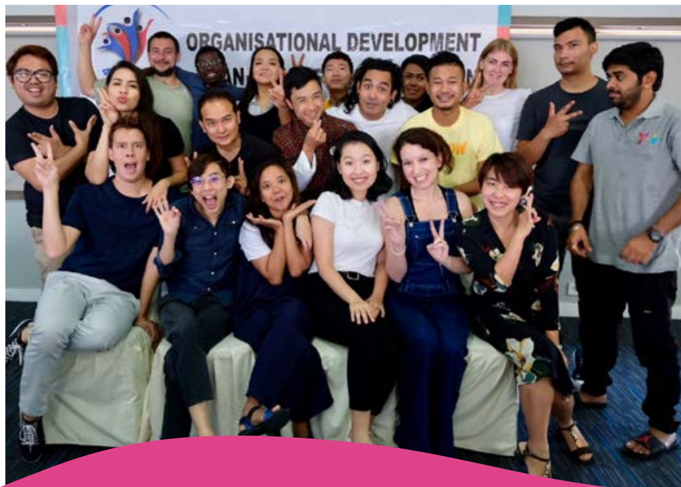
YOUTH LEAD Budget for YKP Grant Programme 2013 - 2019

In August, Youth LEAD, Y-PEER APC, Youth Rise and Y+ gathered in Bali, Indonesia, for the organisational development and change workshop. Also known as 4Youth (The youth consortium formed under the Robert Carr Fund for 2019-2021) came together to work towards improving organisational problem solving and renewal processes, mainly through a more effective and collaborative management culture. The consultation brought together 20 participants from 15 different nationalities, youth networks and organisations working in four different continents. Six participants from Youth LEAD, three from Y-PEER APC, three from Youth RISE, three from Y+ and two from Inti Muda (National network of young-key populations) participated at the consultation. Workshop sessions helped foster dialogue between network partners to hone in on key existing challenges and to find proactive mitigation strategies. These sessions also encouraged participants to consider networks/organisations as a system, rather than fragmented parts and to find solutions to problems through cross-organisational learning approaches. Following the conclusions of the meeting, the consortium worked collectively to develop a group work-plan for 2020, producing timelines and targets for each consortium member that specifically addresses the organisational development and change outcomes.